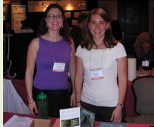
Class 1 participants attending a traditional Asian medicines conference for their project on stopping bear bile use.

The centerpiece of EWCL training is the conservation project. Working in small teams, participants explore key threats to a selected species; identify concrete ways they can contribute to its conservation over the two-year training; and design, implement and evaluate an international conservation campaign. EWCL teams partner directly with international conservation organizations to create campaigns that will result in tangible benefits to the target species. From training workshops that combat illegal poaching of endangered species, to new tools that raise awareness about species protection, to educational materials that engage communities in conservation, to fundraising and in-kind contributions that support conservation initiatives, EWCL projects are making a difference for imperiled species worldwide.