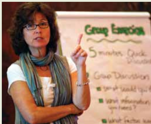
A Board member teaches on facilitation skills.

The two-year training program includes one week of in-person training each year, plus a final, two-day training session and graduation ceremony. The training sessions focus on priority topics, presented by established conservation professionals.