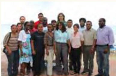
2012-2014 Caribbean EWCL Class.