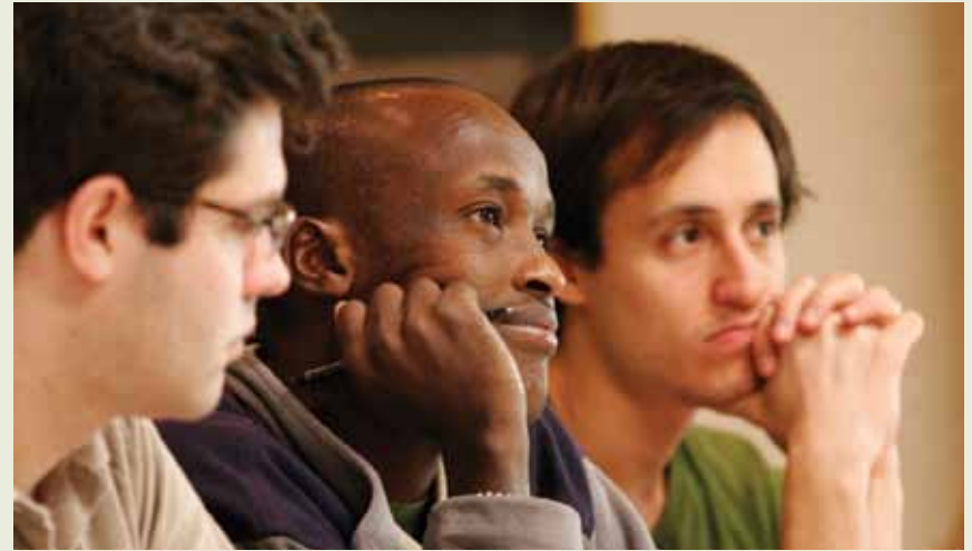
Class 3 participants learn in a conservation workshop at White Oak.

EWCL strives to empower the next generation of conservation leaders and secure a brighter future for imperiled wildlife.