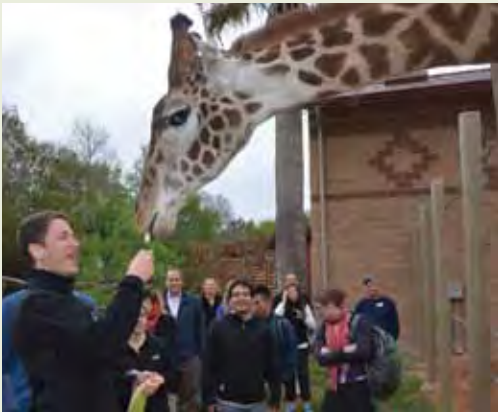
Class 5 participants enjoy opportunity to interact directly with species at the Houston Zoo.

Emerging Wildlife Conservation Leaders (EWCL) was designed to address this need by providing training, hands-on experience, mentoring and networking opportunities to emerging leaders in the conservation field. Through its innovative and effective training programs, EWCL strives to empower the next generation of conservation leaders and secure a brighter future for imperiled wildlife and the communities that co-exist with them around the world.