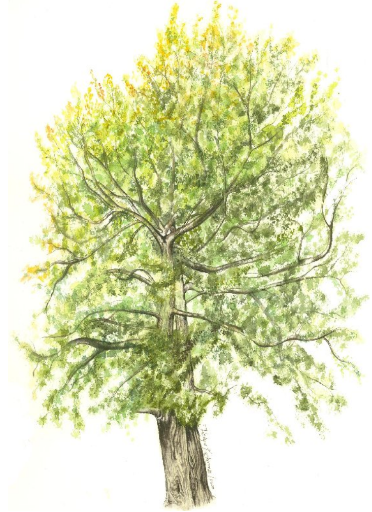
Anatolian Sweetgum Tree

The only Anatolian Sweetgum forest in the world is in Köyceğiz