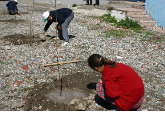
Anatolian Sweetgum Tree Planting with Students, World Forestry Day (March 21, 2011)