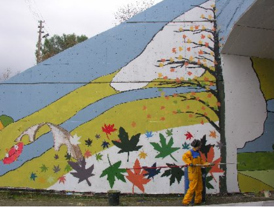
Wall Painting with Köyceğiz People (December 5, 2010)