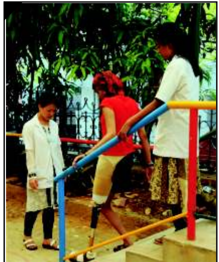
New Limb, New Life

Available to a large number of people with a wide choice suiting lifestyle, comfort, affordability and local accessibility along with therapeutic intervention and surgical referrals to prevent or correct deformities.