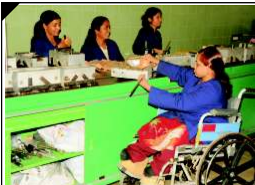
Jaipur Foot Production Unit

The products are now being used in India, Sri Lanka, Bangladesh, Nepal, Ethiopia, Mozambique, Rwanda, Cambodia, Vietnam, Afghanistan & Nigeria.