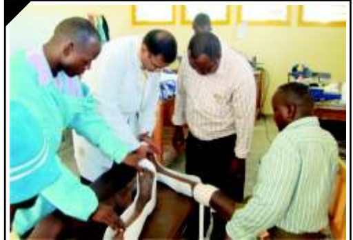
Sharing technology with training centre in Tanzania

Design and Develop Orthoses, Prostheses and its components that are cost effective, light weight, durable based on the need of a large number of people with disabilities specially poor, to be fitted in the quickest possible time.