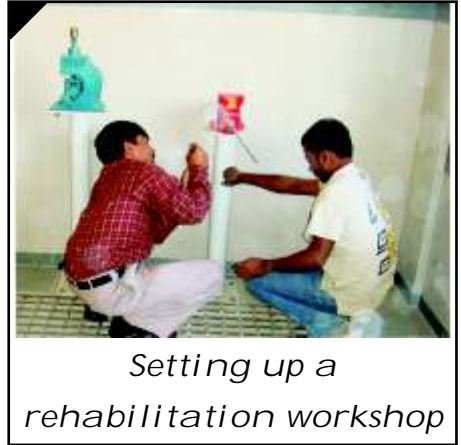
Setting up a rehabilitation workshop

The Centre supports 10 grass root organizations in the Eastern and North Eastern parts of rural India where no rehabilitation facility exists.