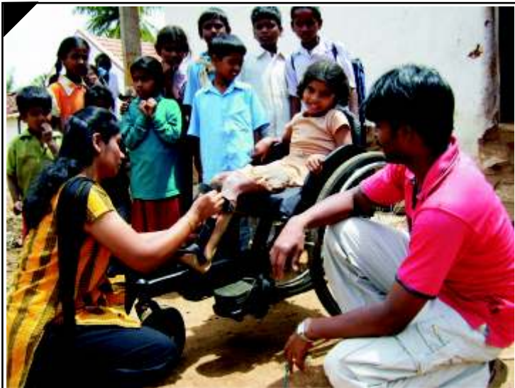
Appropriate rehabilitation service at doorstep

The activities facilitate access to basic needs such as livelihood, healthcare, education, housing etc., by building multi-sectoral linkages for a community based and inclusive development.