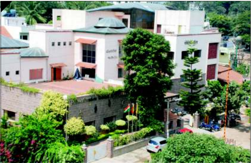
Mobility India Rehabilitation Research & Training Centre, Bangalore

Mobility India's Rehabilitation Research and Training Centre in Bangalore, a model of disability friendliness, houses all its activities. Regional Resource Centre in Kolkata was established in 1998. The organisation has a perfect blend of disability and non-disability at all levels - an innovative organisation of abilities and commitment in its approach to address the real need.