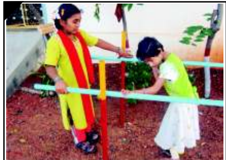
Therapy set up using local resources