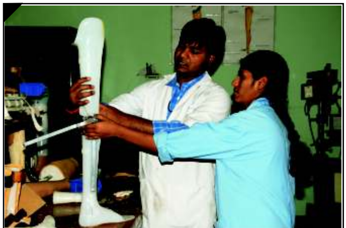
Practical Session in assembling orthoses

Conducts courses to develop appropriate rehabilitation personnel to provide prosthetics, orthotics, wheelchair & therapy services and promote community based rehabilitation