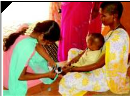
Quality rehabilitation reaching rural areas

Through its mobile workshop, services are made available over large distances and definite changes ensured in the persons life.