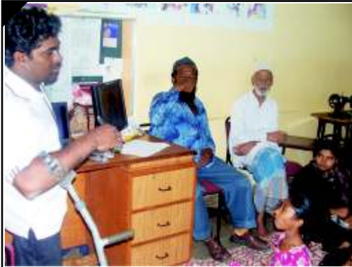
Creating awareness about disability issues