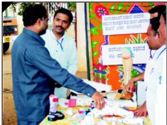
Importance of assistive devices in rehabilitation