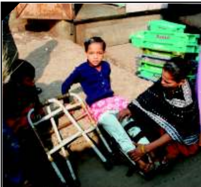
Fitting assistive device at community outreach programme

In addition, it runs a Community Outreach programme in the Garden Reach slums of Kolkata. Providing assistive devices, educational support, corrective surgery and home based therapy to children with disabilities.