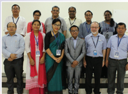
Medical Practitioners from Manipur