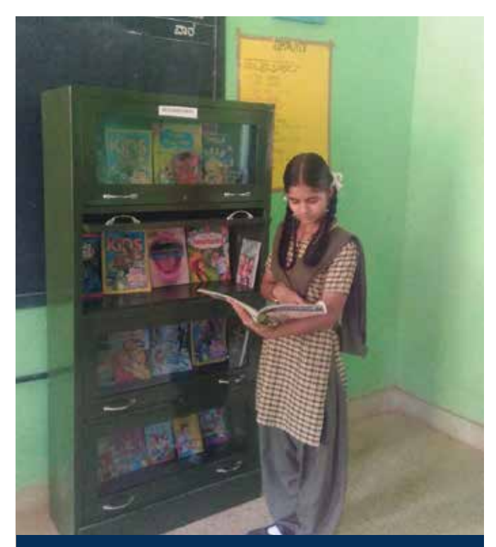
We are thankful to HCL Foundation for supporting 'My School' program.