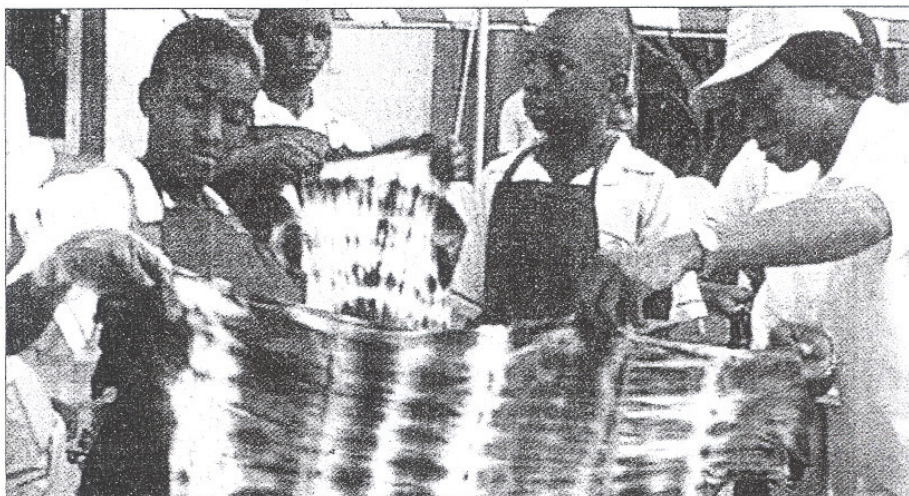
• Some of the participating youth

With the combined efforts at solving the Niger Delta problem gaining momentum, different organisations are applying different approaches at resolving the same malaise, which has brought the economy of the area to its knees. The latest is targeted at the youth of school age. Ahamefula Ogbu writes