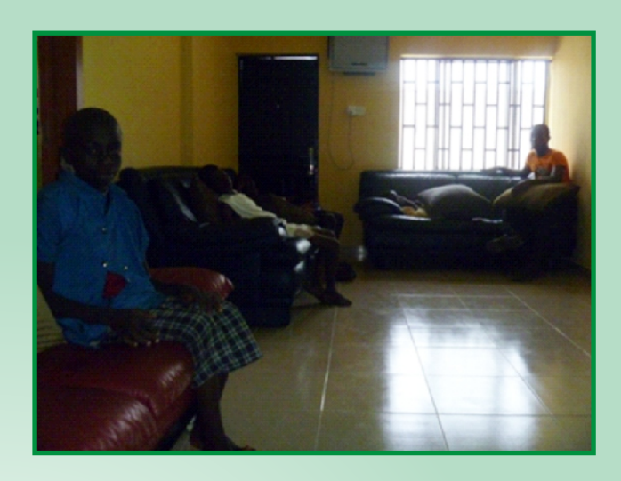
Lounge In Use