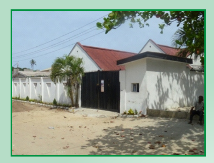
Welcome! Street Side View