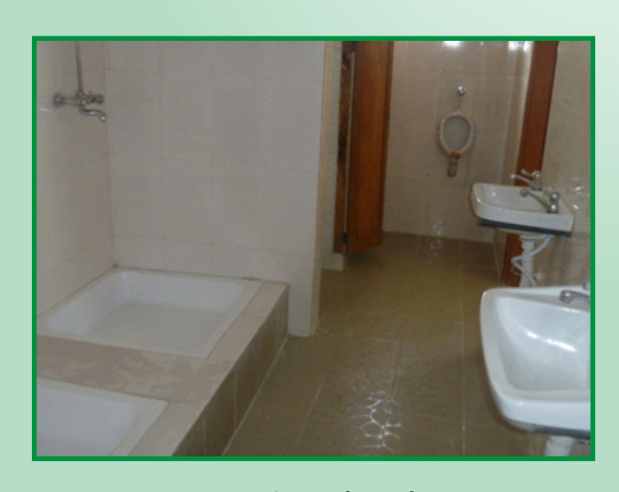
Big Boy's Bathroom