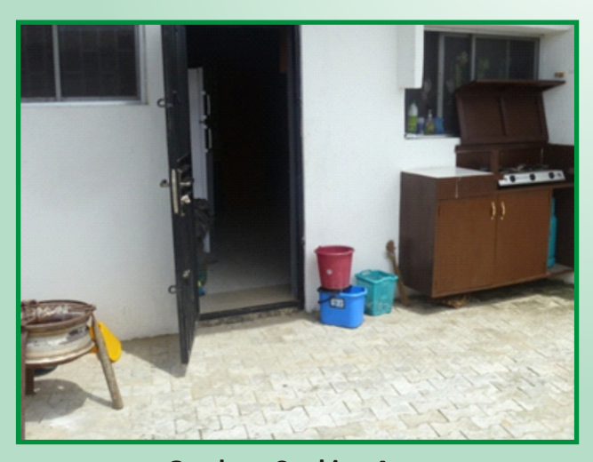
Outdoor Cooking Area