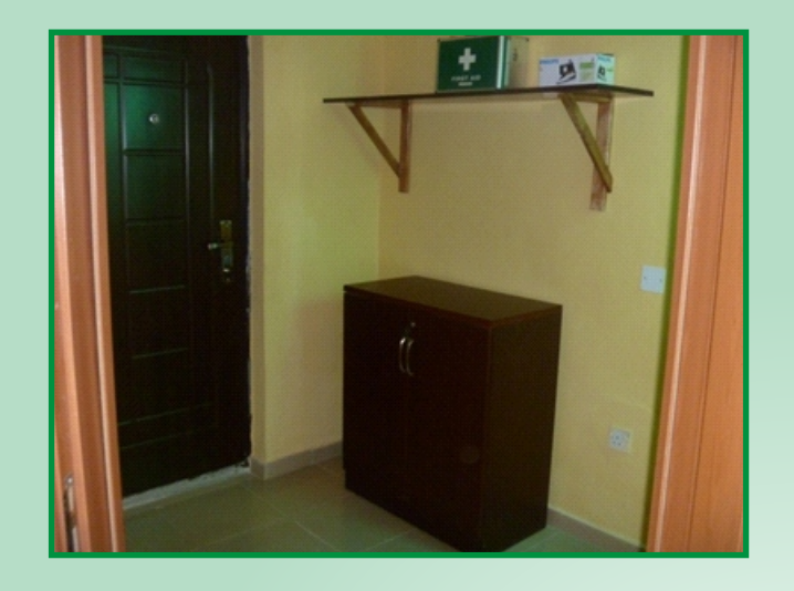
First Aid Room