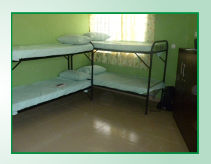
Small Boy's Bedroom