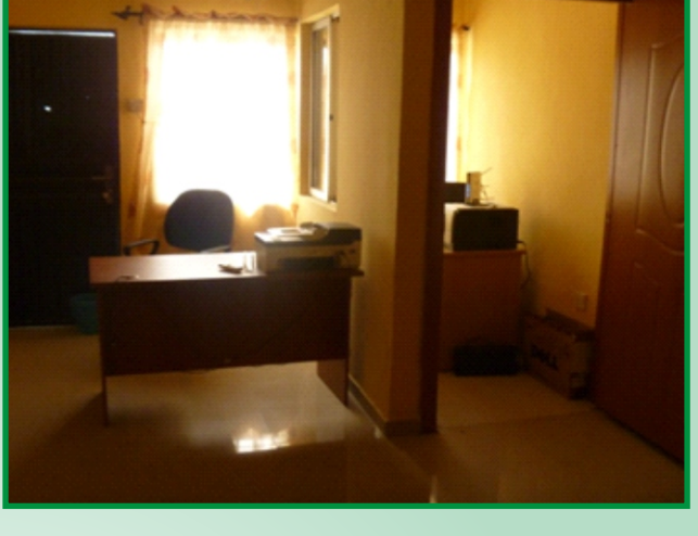
Secretary/Assistant's Desk and Server Room