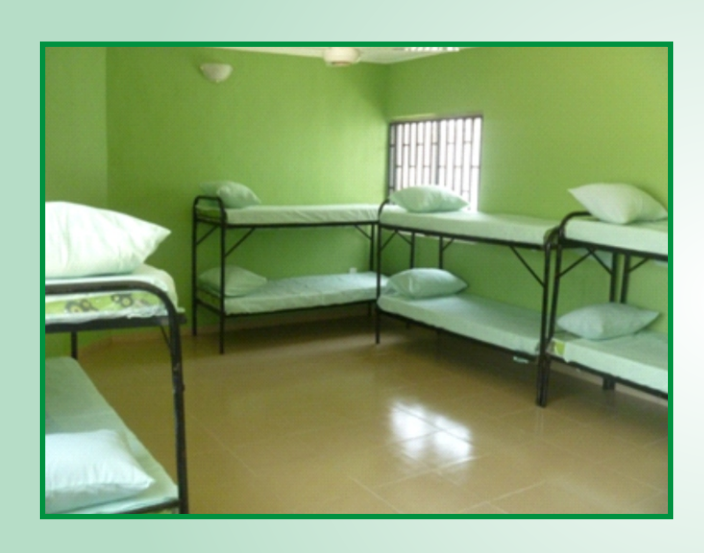
Big Boys' Bedroom