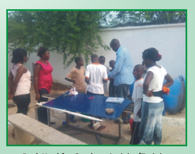
Back Yard for Outdoor Activity/Training