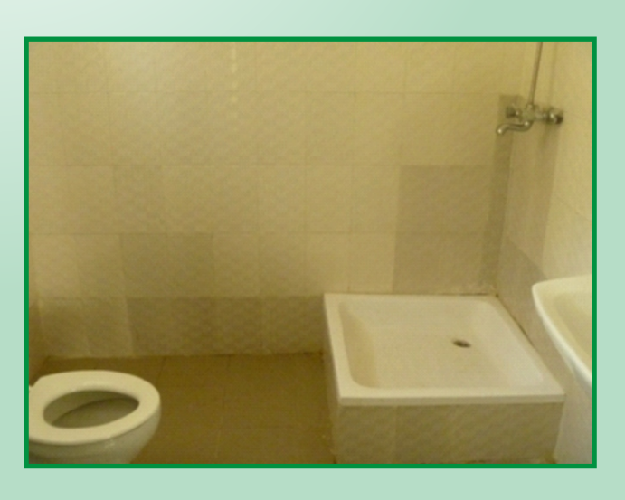
Small Boy's Bathroom