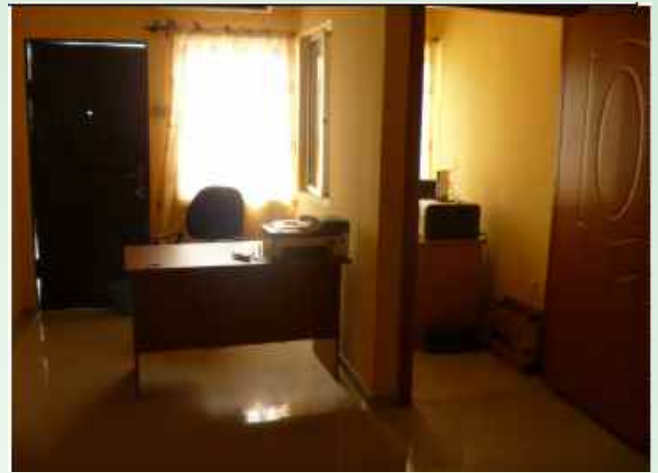
Secretary/Assistant's Desk and Server Room