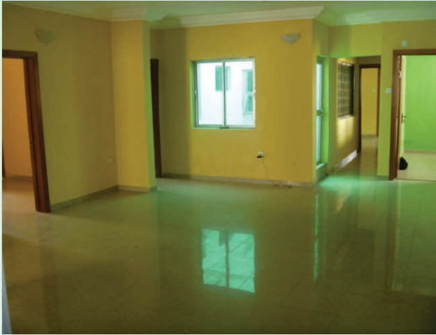
Open Room for Meetings, Trainings and Meals