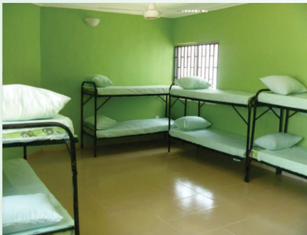
Big Boys' Bedroom