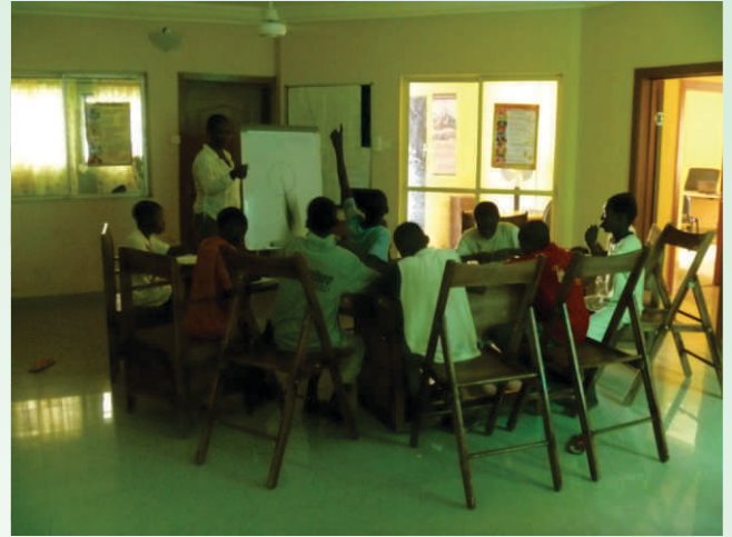
Open Room in Use