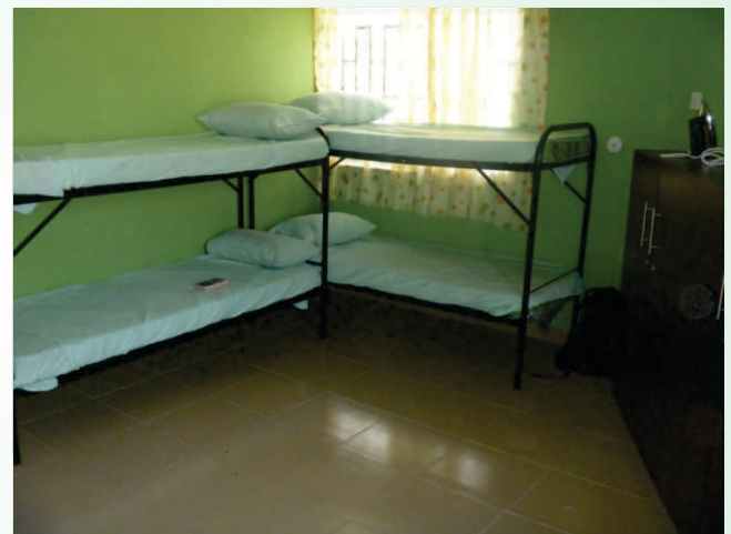
Small Boy's Bedroom