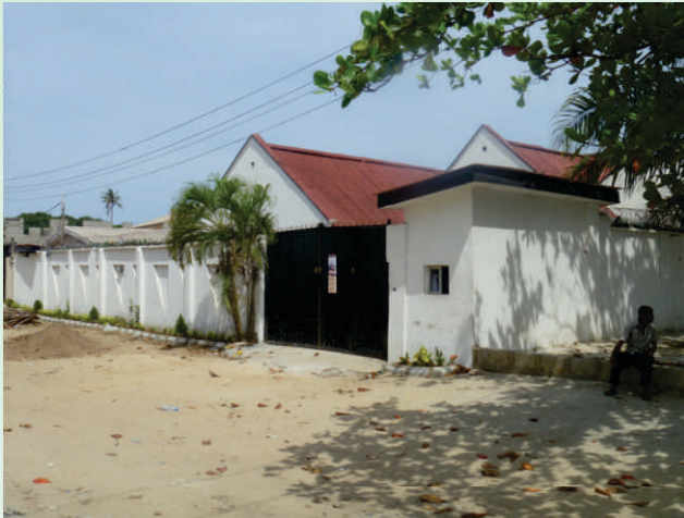
Welcome! Street Side View