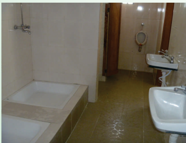
Big Boy's Bathroom