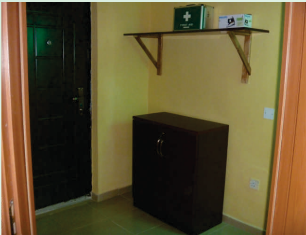
First Aid Room