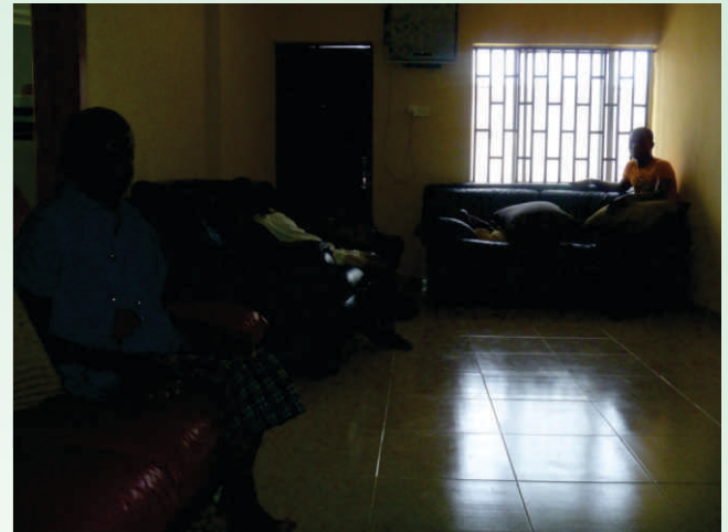
Lounge In Use