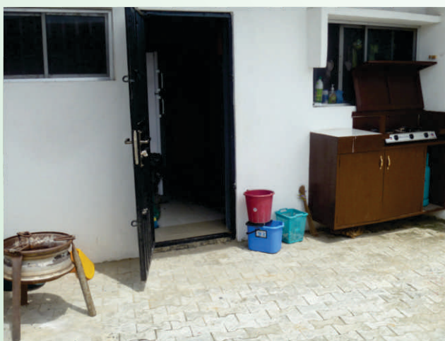
Outdoor Cooking Area