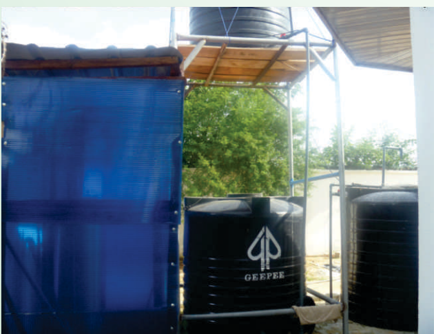
Borehole and Water Treatment