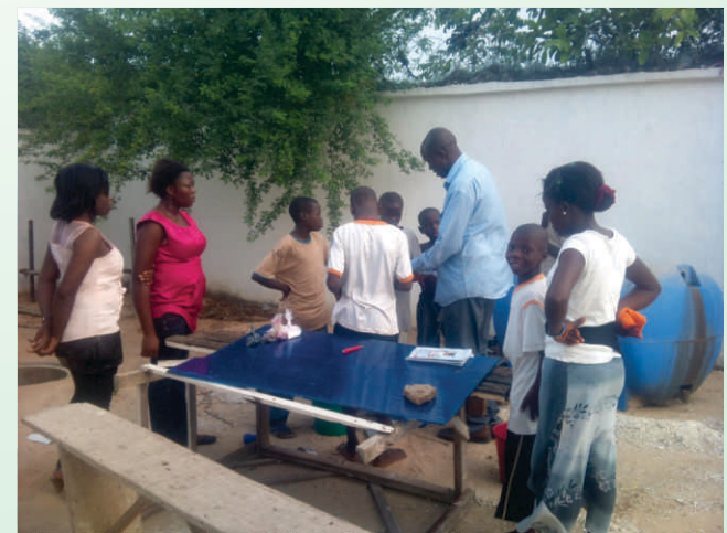
Back Yard for Outdoor Activity/Training