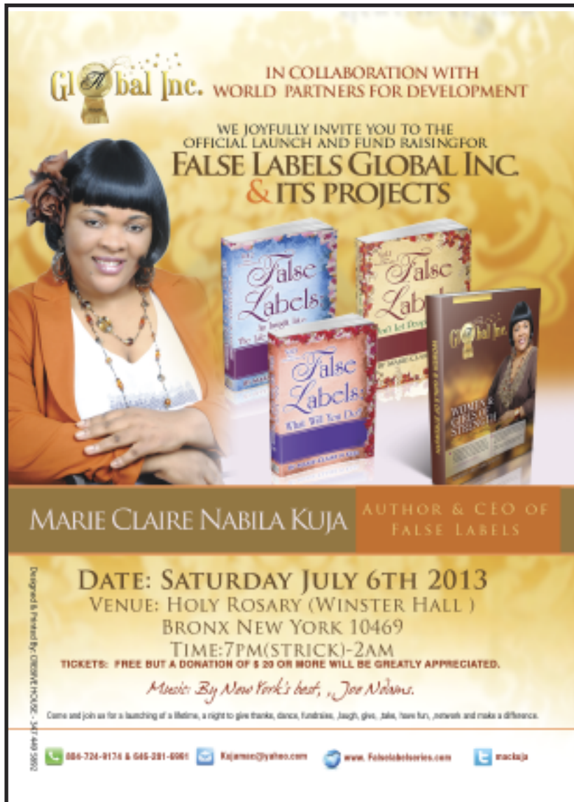
Event flyer for New York NGO & Book launch

CONTACT GIRL CHILD NETWORK ZIMBABWE OR WHATSUP