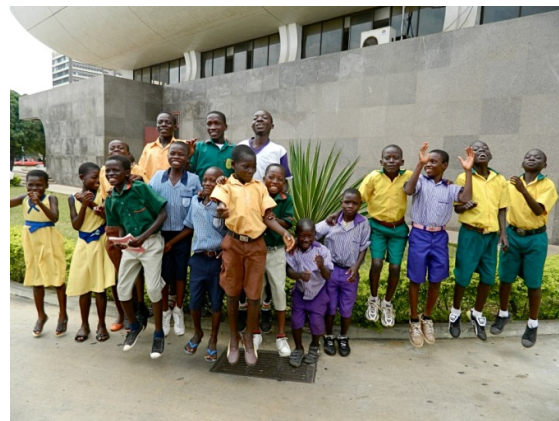
Educational excursion trip to the Capital of Ghana with some of the rescued children – kids very excited