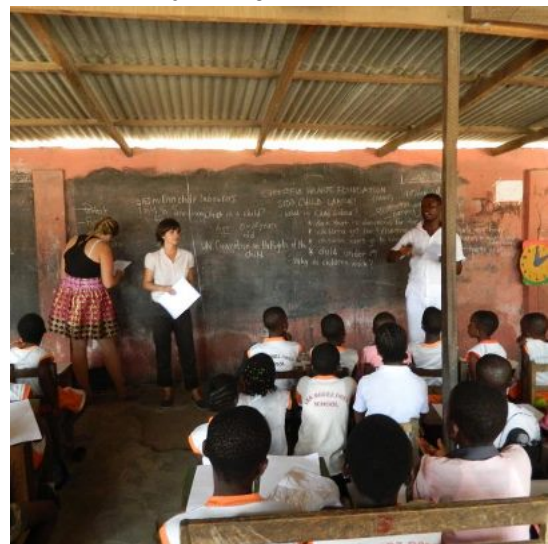
Some sessions of the Child Labour Educational talks in schools by the Cheerful Hearts Foundation