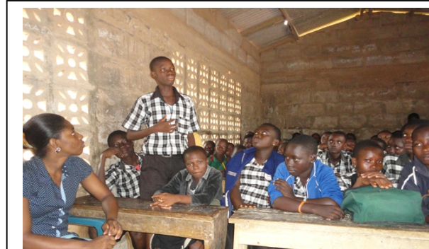
One of the kids shares his experience when he was a child labourer and advised all pupils present.