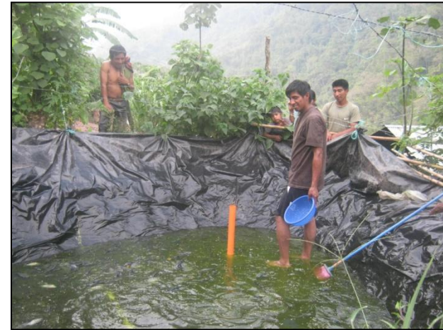
One community member cleans his fish pond.

The fish being raised by three families were checked for any diseases, and their ponds were monitored for cleanliness. Also, the pigs of two families were given vitamins and medicine to eliminate parasites.