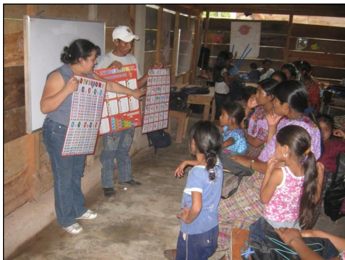
Agros provides learning materials for Villa Linda's school and the adult literacy classes.

Agros provided the community school with learning materials and supplies to help ensure that the children receive the best possible education. Supplies and learning materials were also provided for the community's adult literacy program.