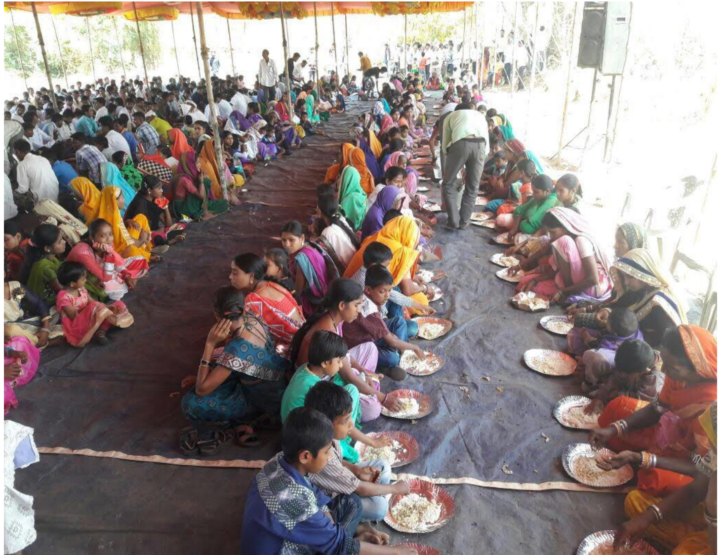
Sickle Cell Camp Details