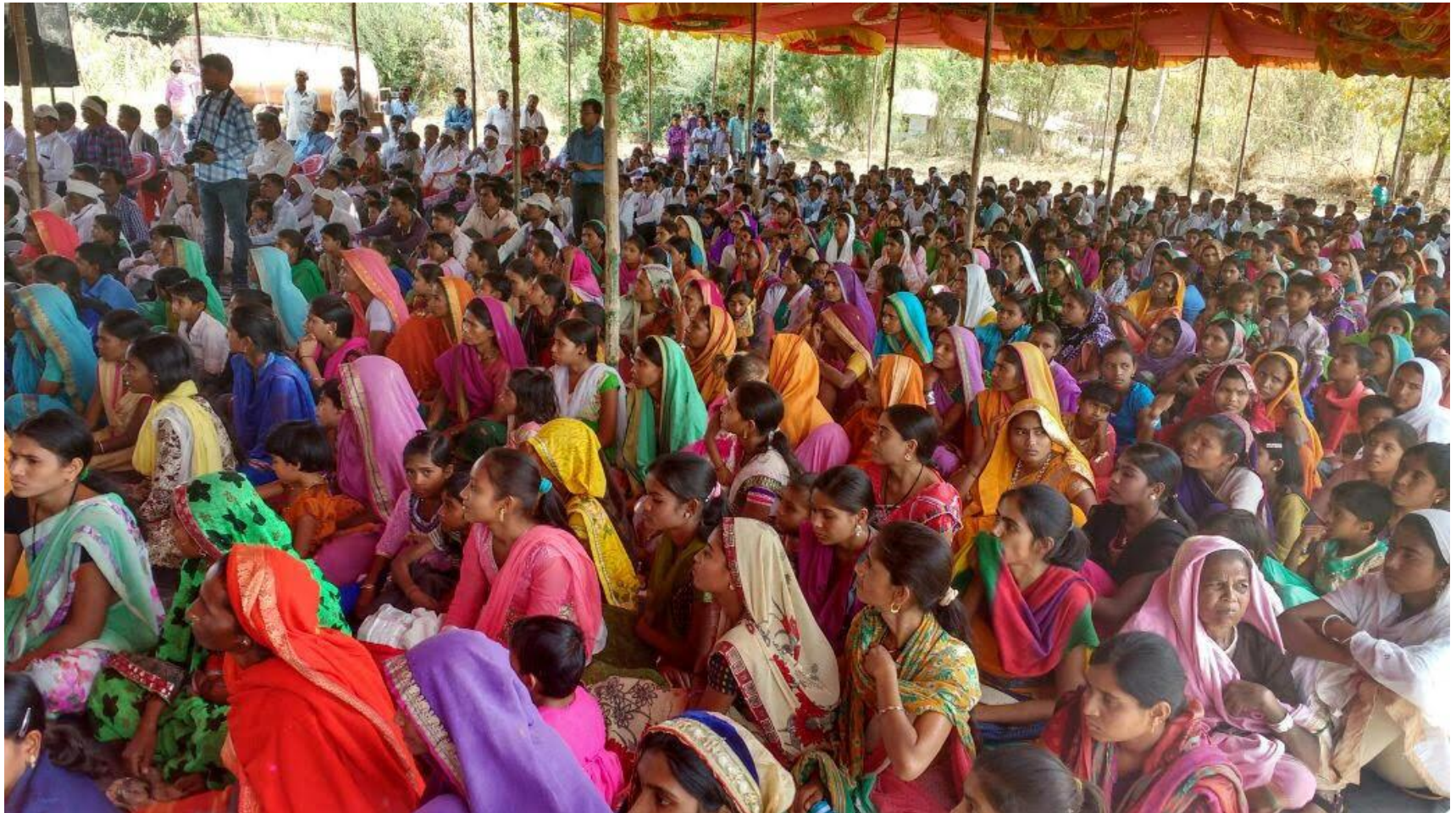
Sickle Cell Camp Details