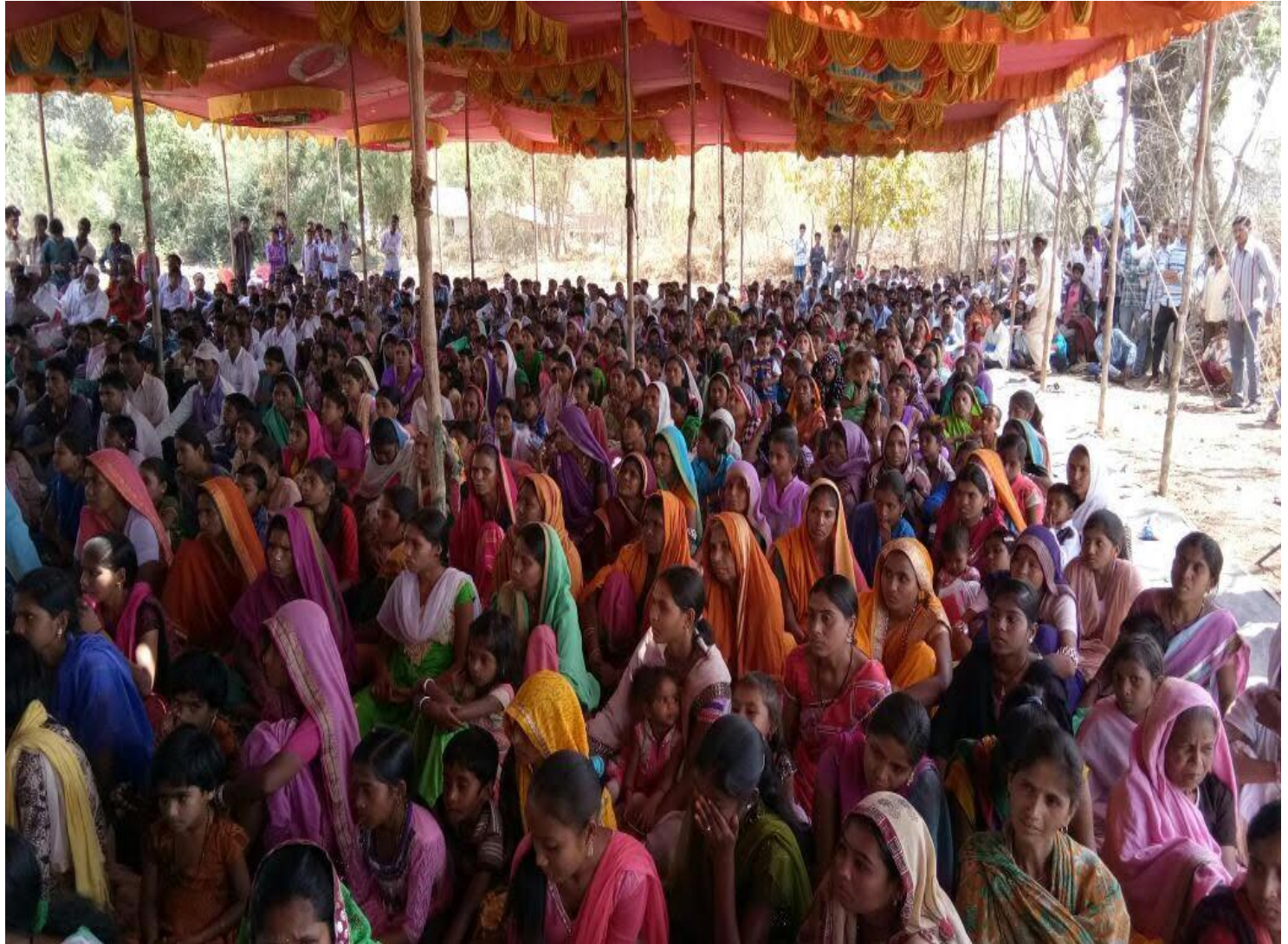
Sickle Cell Camp Details