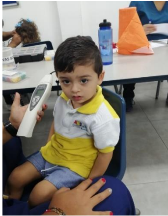
ABC n ME SCHOOL