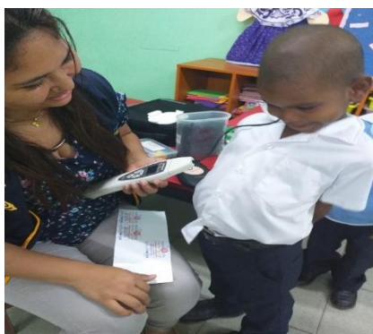
Torrijos – Carter School

For information on how to take this program to a particular school, contact us.