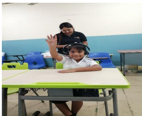
John F. Kennedy School