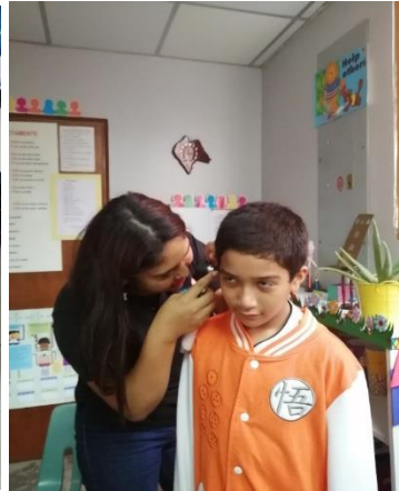
AIP CERRO VIENTO SCHOOL