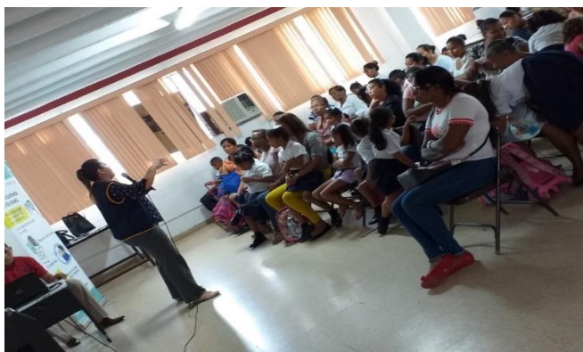
Auditory Health Talk for parents and teachers – Jeronimo de la Ossa School.