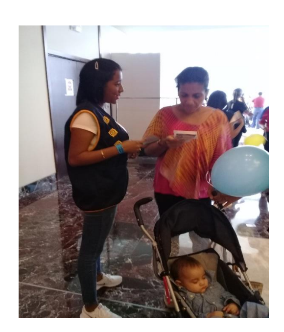
Giving important tips to moms.