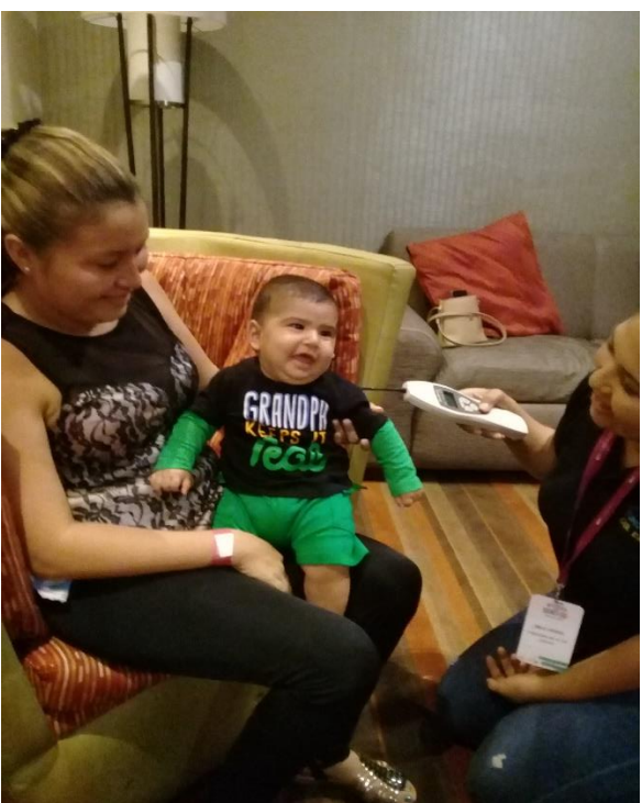
Doing hearing test at Baby's Fair.

And in the facilities of our foundation, auditory tests are always carried out to carry out their annual control.