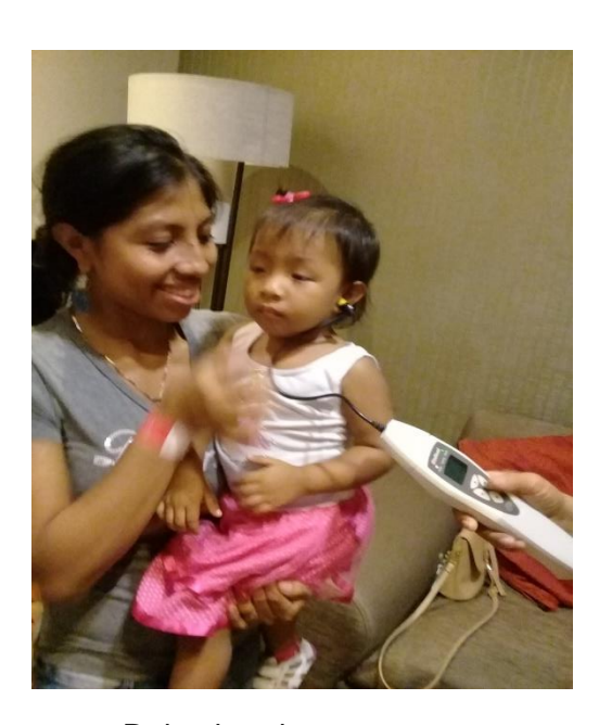
Doing hearing tests.