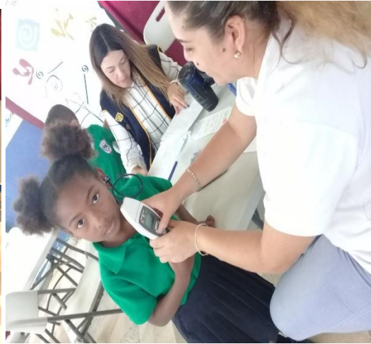
Continue doing earing test at ALEGRIA PRE-SCHOOL .