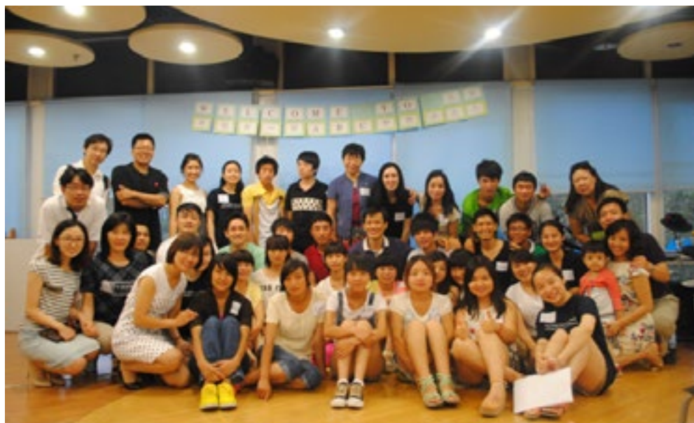
July 7 Welcome Party 七月欢迎晚会