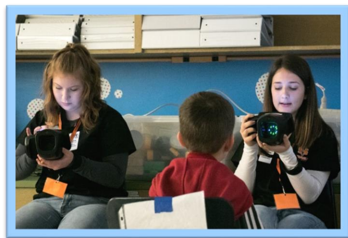
Students of the Sprague High School Health Services program screen children at Liberty Elementary in Salem this past January. KEX Kids Fund support has enabled OLSHF to screen over 54,000 students in the Salem-Keizer School District the past three years.