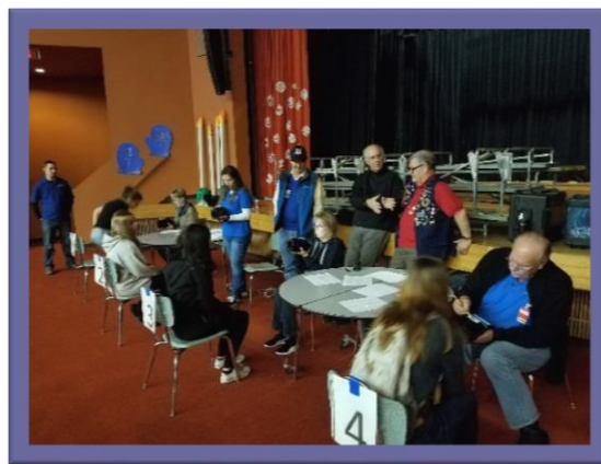
Screening by the St. Helens Lions and 2 former Rainier School District staffers. The St. Helens Lions traveled all the way to Rainier to screen 821 kids in just over 3 hours!