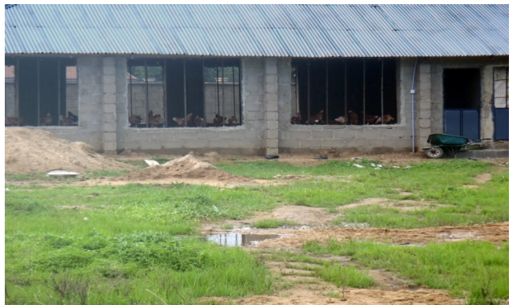
New Poultry Farm Chicken Coops

Exciting Note!!! The new Chicken Coops were designed by the LI Welding company. Fencing was welded in place with metal supports to add structural integrity to the clay coops.