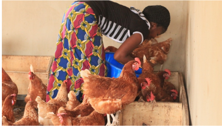
New Poultry Farm Open and Thriving

With the launch of the 2011 Poultry Farm program, it's official - the next generation of leaders have stepped forward to establish a poultry farm - thanks to the inspiration , leadership , and financial investment of those who first completed the Leadership Initiative program and launched successful businesses.