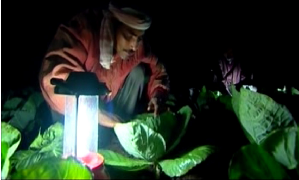
Lighting a Billion Lives©a - A TERI Initiative An elderly village artisan making traditional cane mat under the bright light of the solar lantern State: Assam