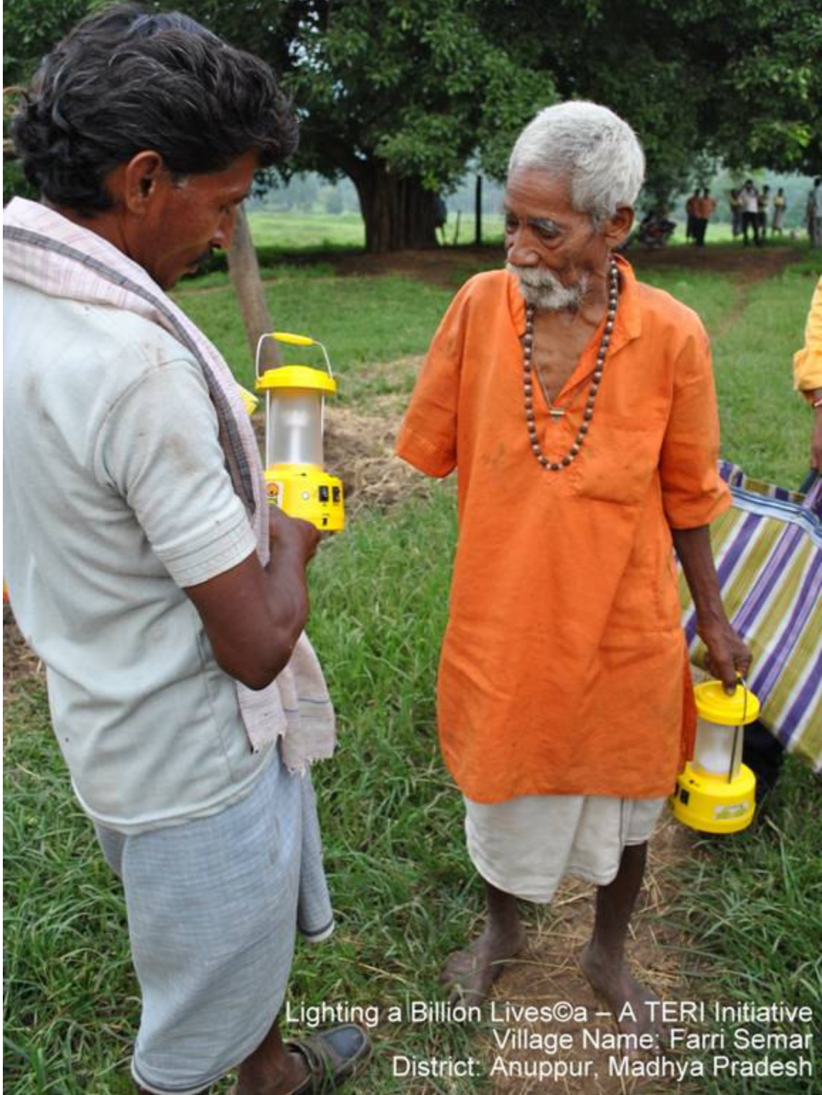
Lighting a Billion Lives©a – A TERI Initiative Village Name: Farri Semar District: Anuppur, Madhya Pradesh

A physically challenged village elderly on his way to the LaBL solar charging station to give the discharged lantern used previous night back to the entrepreneur for charging