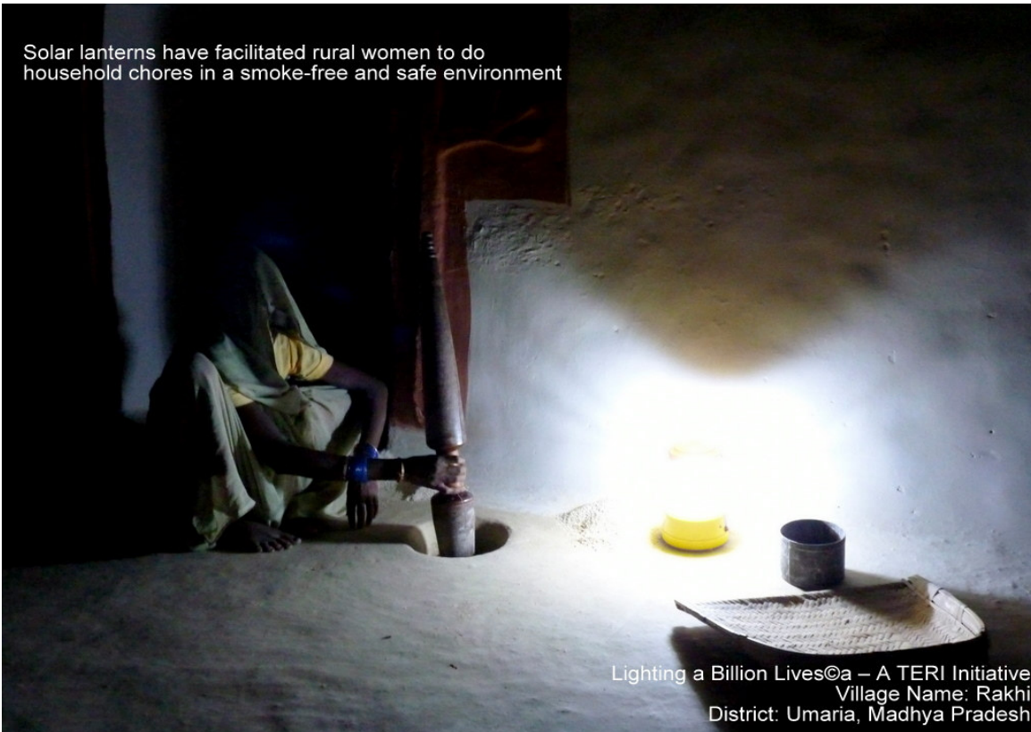
Lighting a Billion Lives©a – A TERI Initiative Village Name: Rakhi District: Umaria, Madhya Pradesh