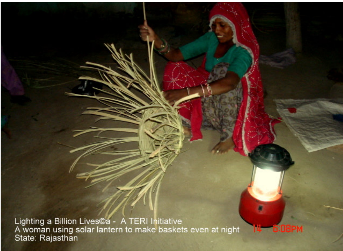
Lighting a Billion Lives©a - A TERI Initiative A woman using solar lantern to make baskets even at night State: Rajasthan