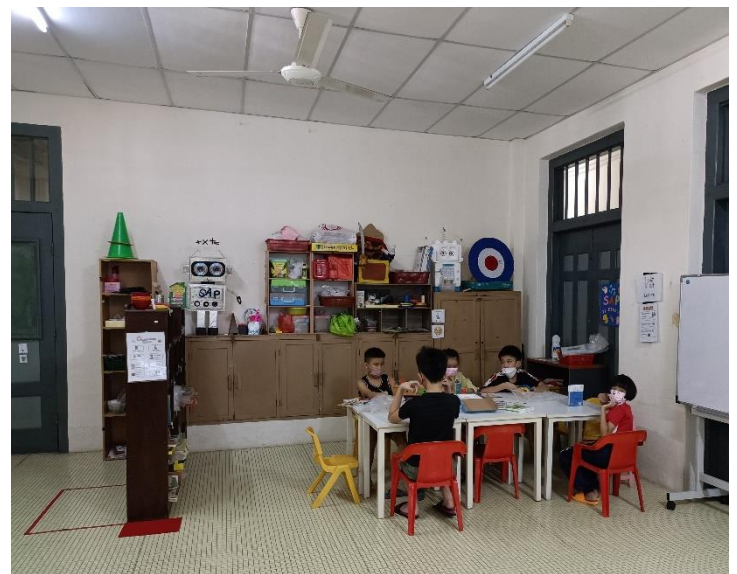
Study and group activity areas in SAP classroom