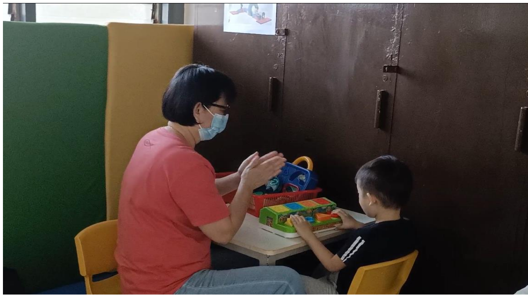
Happy learning at our stimulation room