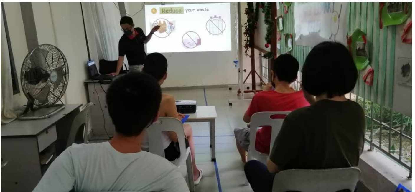
They have learned to practice the 3R's during their language time