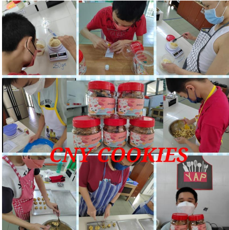
Baking chocolate chip cookies for celebrating CNY (Private and confidential)