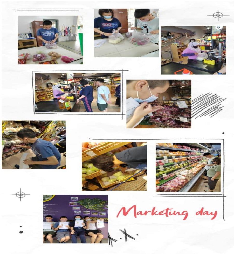
YAP students feel excited and enjoyable during grocery shopping