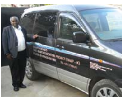
THAP's new van