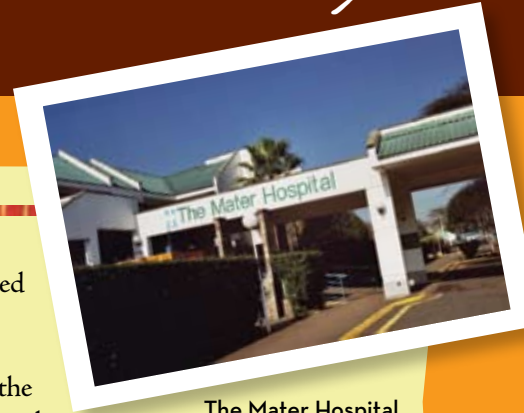
The Mater Hospital, THAP Partner