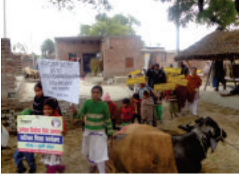
Full participation of girls in the rally.