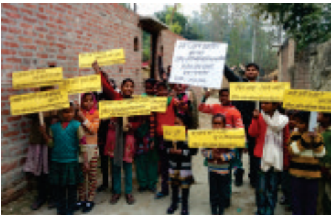
Girls with full enthusiasm and energy involved themselves in the campaign. They went from door to door spreading awareness about the benefits of cleanliness.