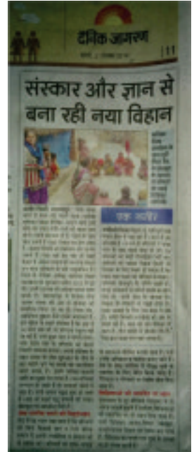
Newspaper cutting of a daily newspaper