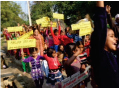
Girls enjoying their participation.