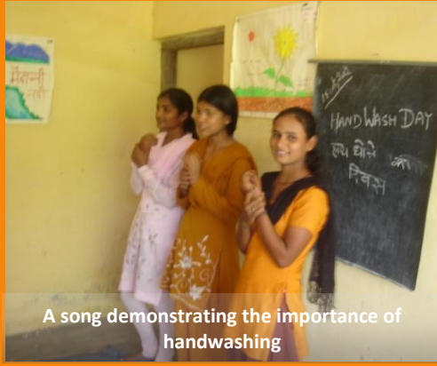
A song demonstrating the importance of handwashing