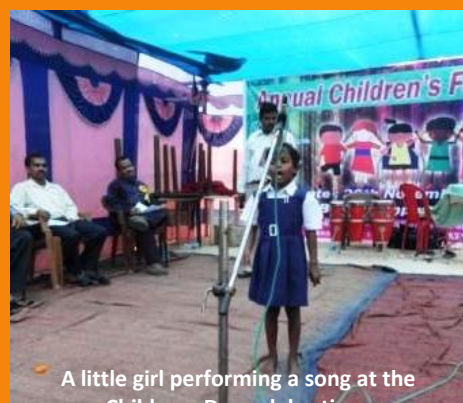
A little girl performing a song at the Childrens Day celebrations

A fair for the children was organised at the block level. 337 girls from 30 centers were present at the fair. Around 200 girls took part in the various activities that