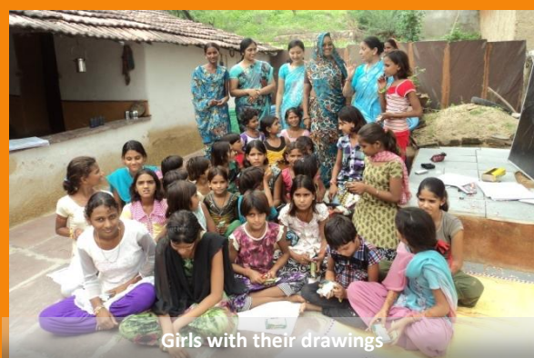
Girls with their drawings

On the occasion of Children's day a drawing competition was organized at the fifteen centers sponsored by CFCL.