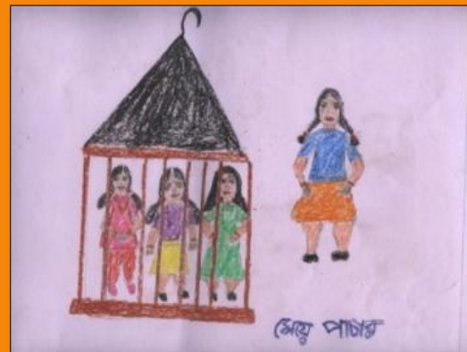
Drawings by the Girls