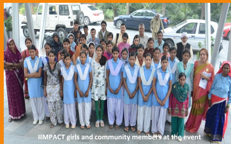
IIMPACT girls and community members at the event