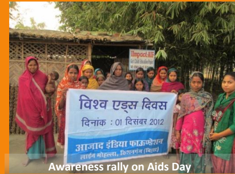
Awareness rally on Aids Day

World AIDS Day was observed at the centers with a rally. The community members were given information about AIDS. Meetings were organized with the parents of the girls to spread awareness.