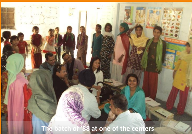
The batch of '88 at one of the centers

The batch of 88 who flew in from across India like Bangalore, Mumbai, Chennai spent quality time interacting with the girls and understanding the various activities typical to an IIMPACT learning center.