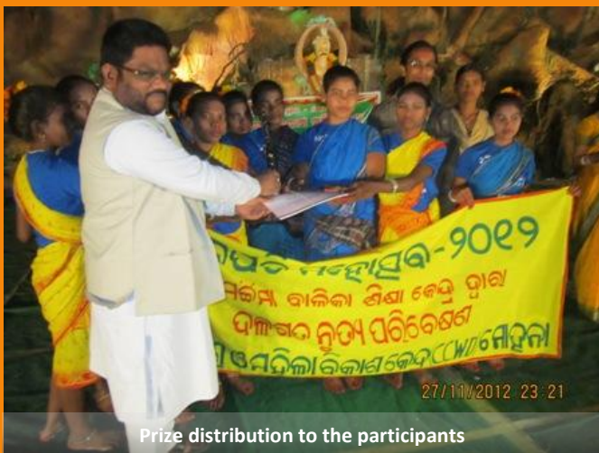
Prize distribution to the participants

Community meetings are very essential in an area where the population is predominantly tribal. Regular discussions to dispel the inhibitions and solve other center related problems are carried out. This time in the meeting issues like child trafficking, child rights and challenges of girls education were discussed.