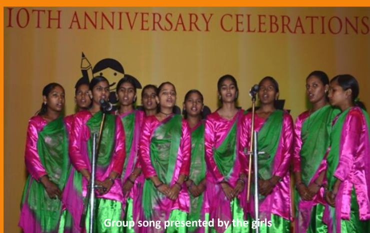
Group song presented by the girls