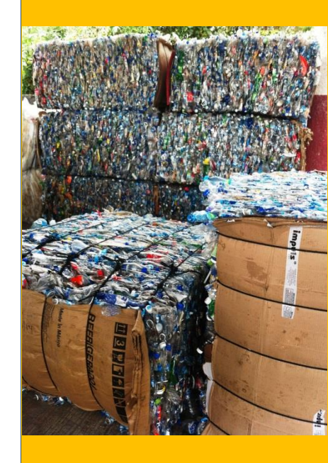
Bales of plastic bottles in the Camar collection center in Cozumel.