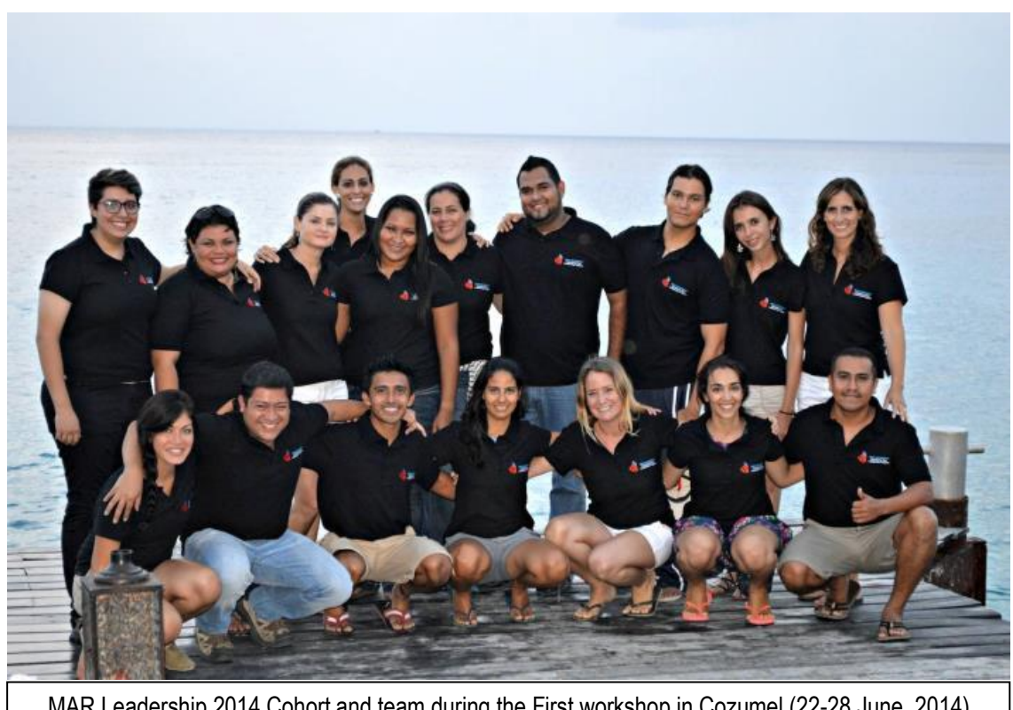
MAR Leadership 2014 Cohort and team during the First workshop in Cozumel (22-28 June, 2014)