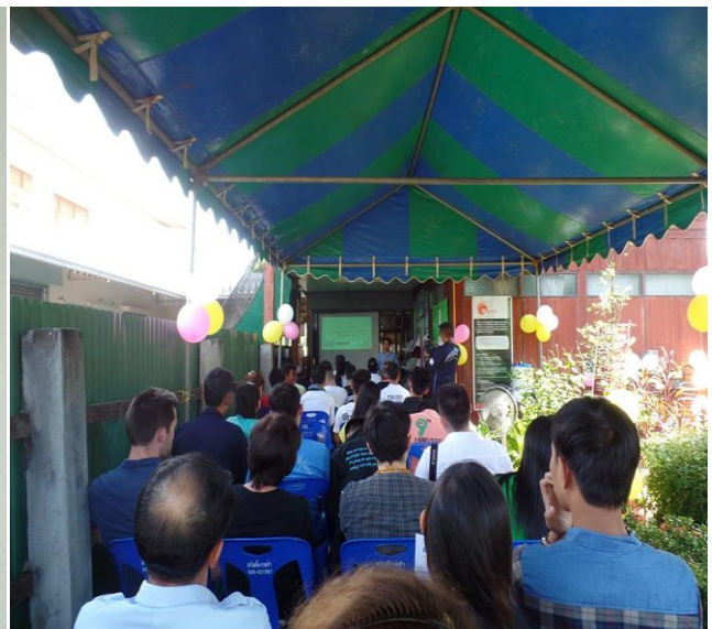
Information Sharing Section at Thabyay GED Test center