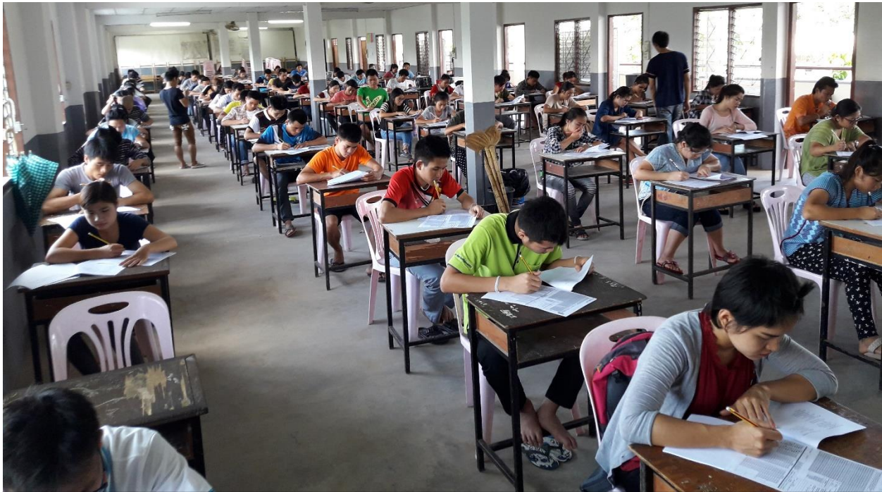
Students taking the Diagnostic Test at a Migrant Learning Center in Mae Sot

Most of them have completed their informal education in refugee camps or migrant schools. Several groups of Non-Government Organizations (NGOs) and Community Based Organizations (CBOs) have jointly helped the students and young adults get the relevant skills according to their needs and aims.