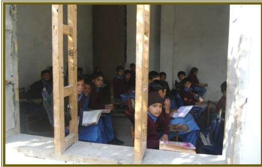
Badazia School #1 needs funding to install proper doors and windows.