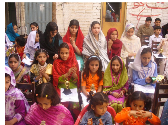
Students from the Abdara school receive their merit awards, trophies and prizes at year end

Because the curriculum of Global Education Campaign schools conforms to local governments' regulations, a graduate of one of our schools can easily be admitted to other schools or colleges.