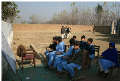
Classes at Kalu Shah School, above, met outdoors until a new school building, below, was constructed.