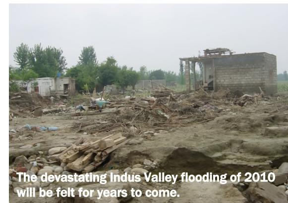
The devastating Indus Valley flooding of 2010 will be felt for years to come.

Because the curriculum of Global Education Campaign schools conforms to local governments' regulations, a graduate of one of our schools can easily be admitted to other schools or colleges.