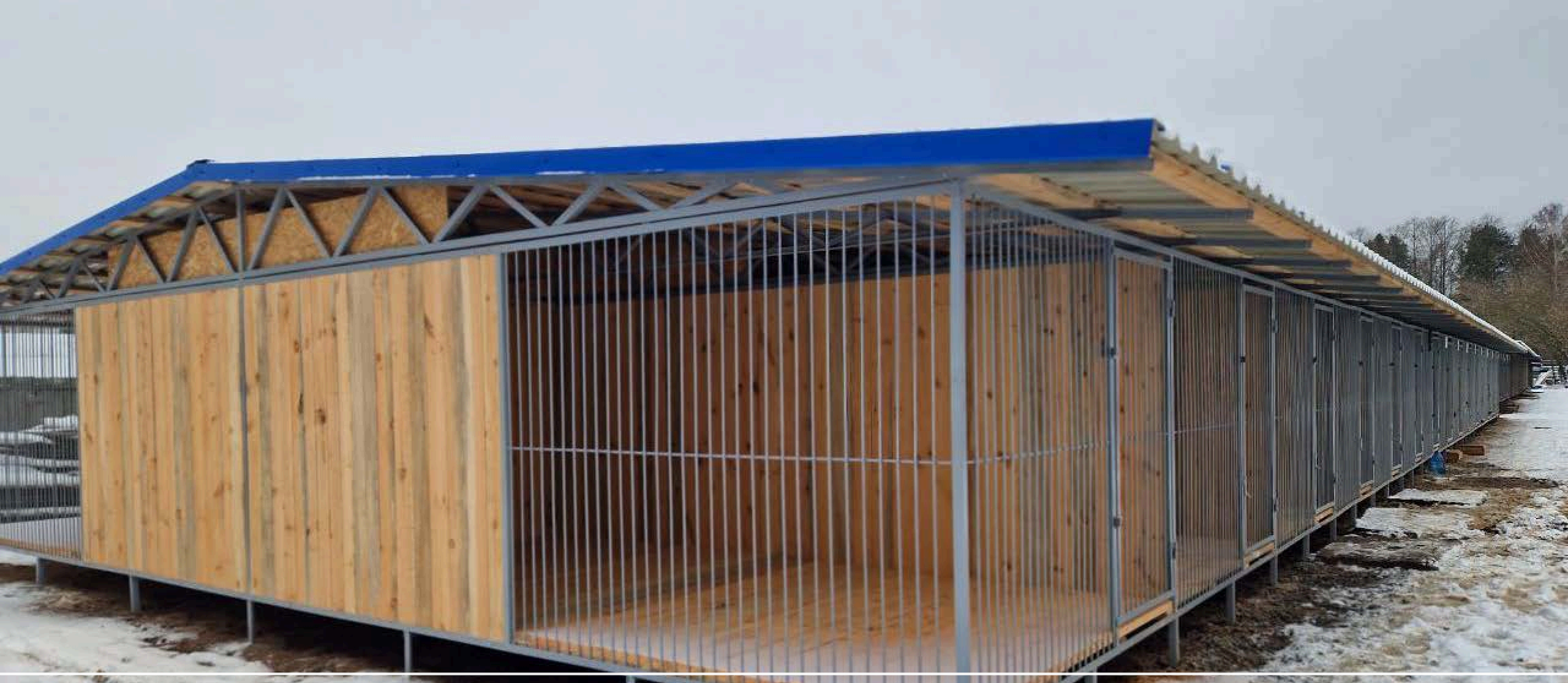
Construction of enclosures