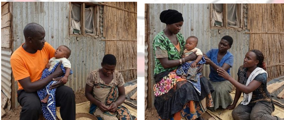
Photos of LHMHA staff members, community-based volunteer, the caretaker, and the abandoned baby

As mentioned above, the caretaker expressed an urgent need for support and protection of the baby for LHMHA, as she is worried that the baby will be kidnapped for the purposes of trafficking or child labor.