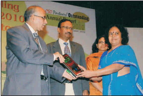
Trustee receiving Outstanding Annual Report Award- 2010