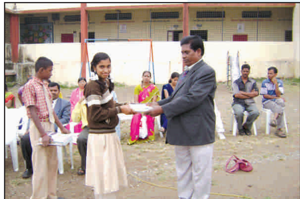
Distribution of school materials