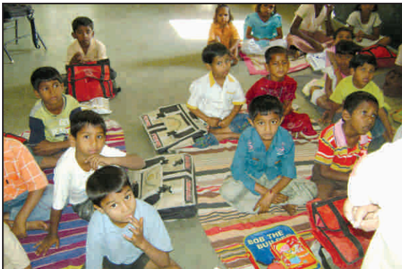
Class for out of school children