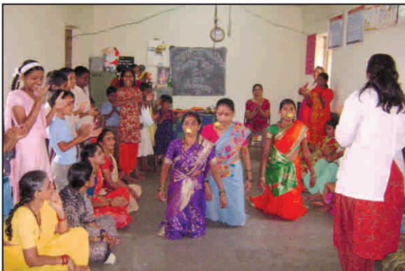
Part of women's day celebration