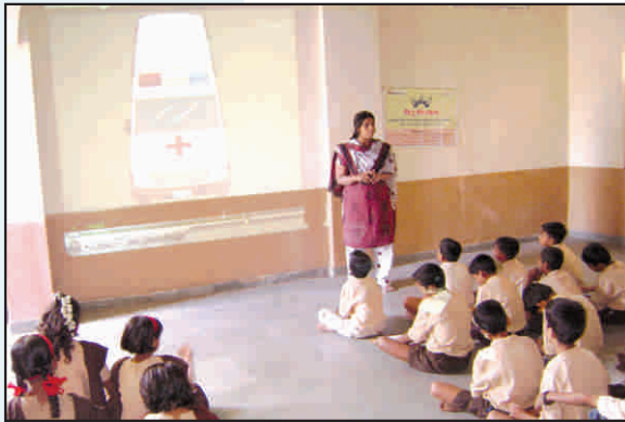
Use of educational CD