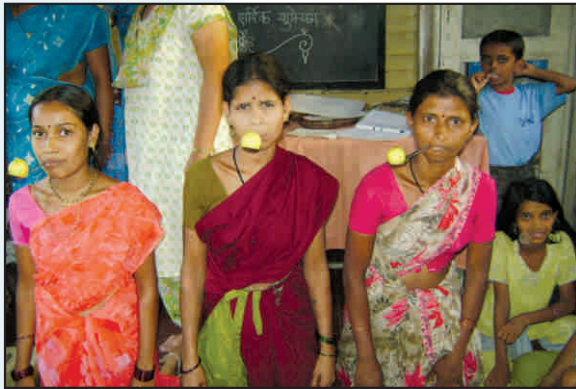
Ready... Steady... Go