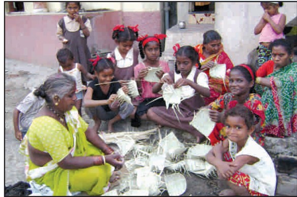
Newly identified slum