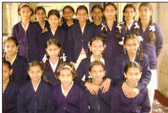
Ready to face winter