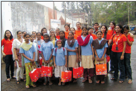
Volunteers from Vodafone with children