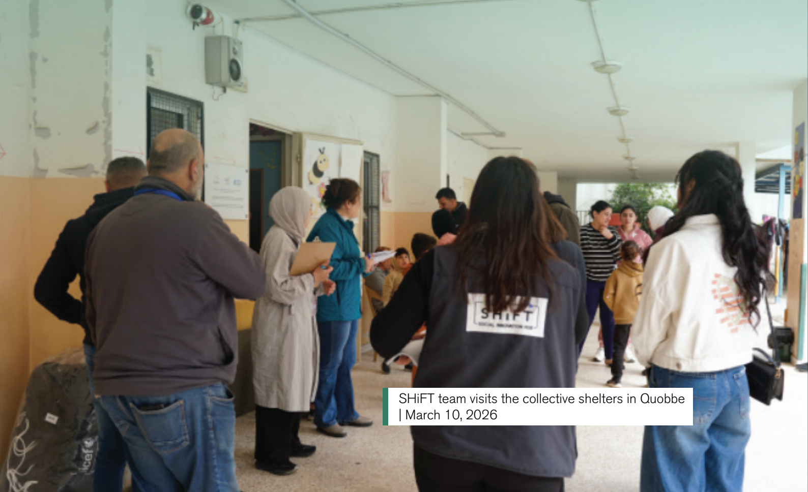
SHiFT team visits the collective shelters in Quobbe | March 10, 2026