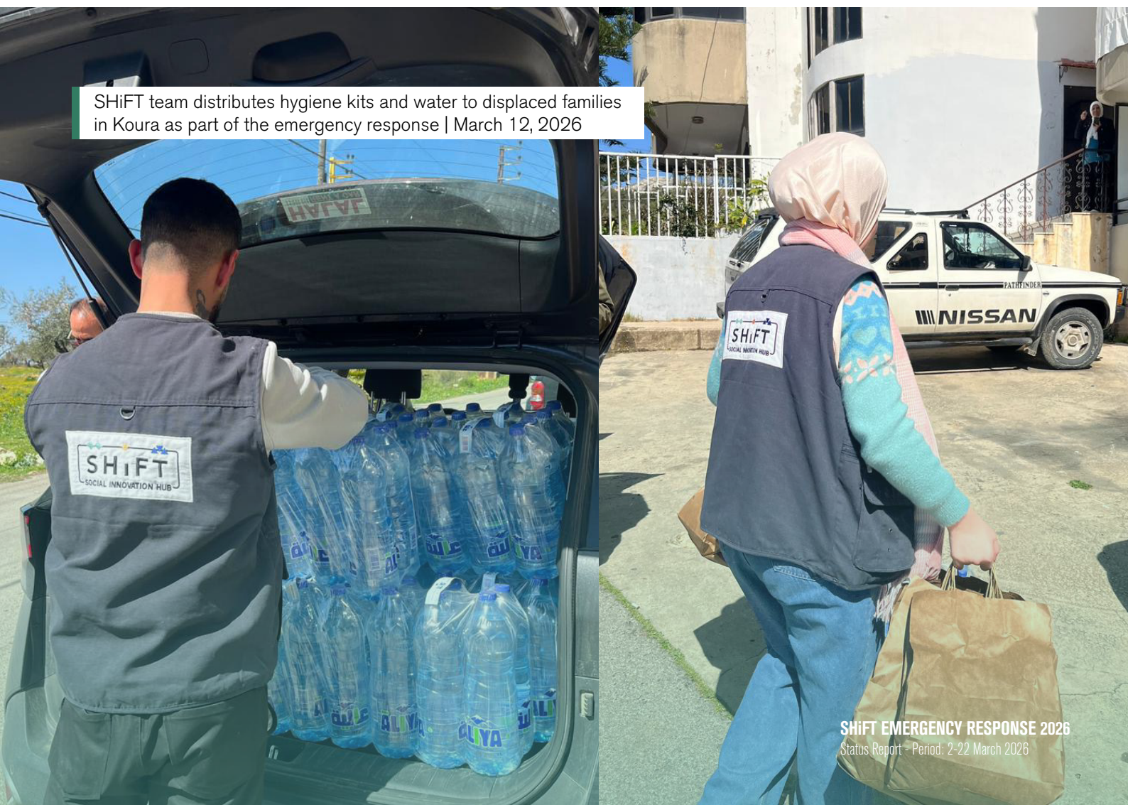
SHiFT team distributes hygiene kits and water to displaced families in Koura as part of the emergency response | March 12, 2026