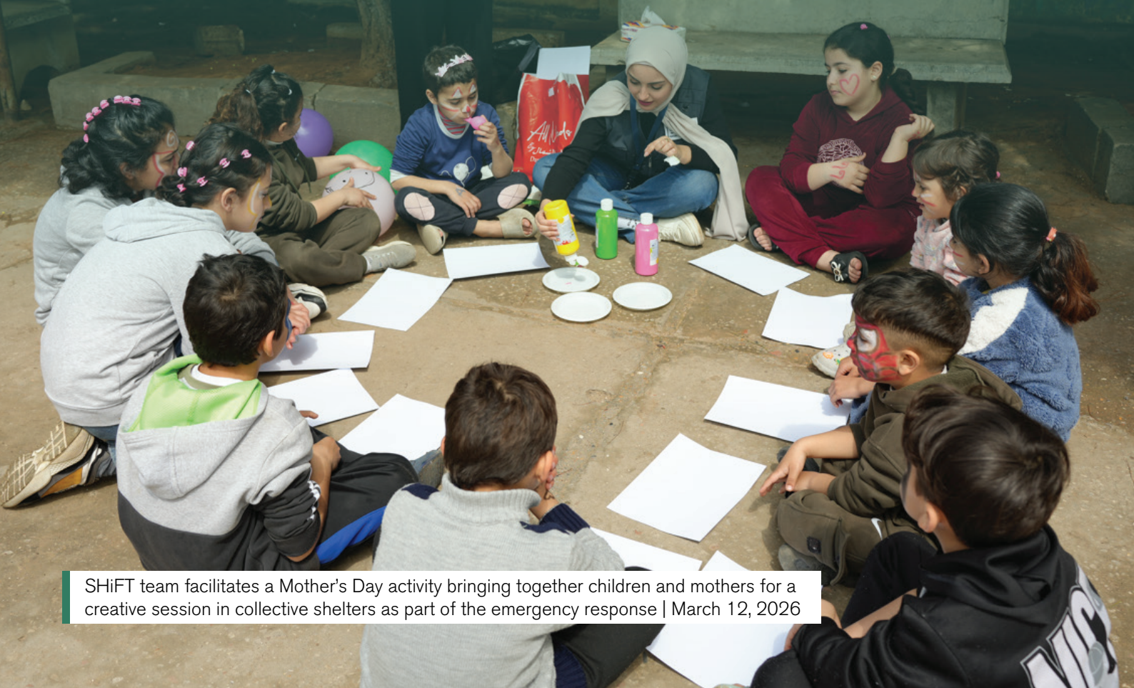
SHiFT team facilitates a Mother's Day activity bringing together children and mothers for a creative session in collective shelters as part of the emergency response | March 12, 2026