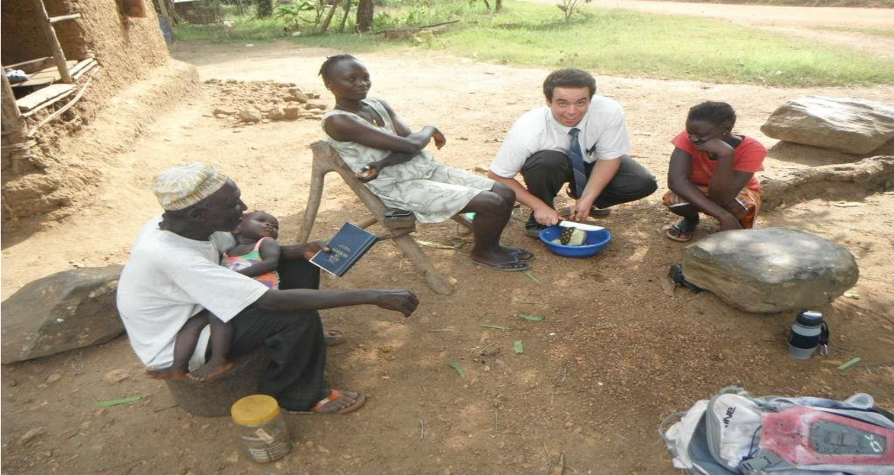
Community engagement with Liberian families during missionary service