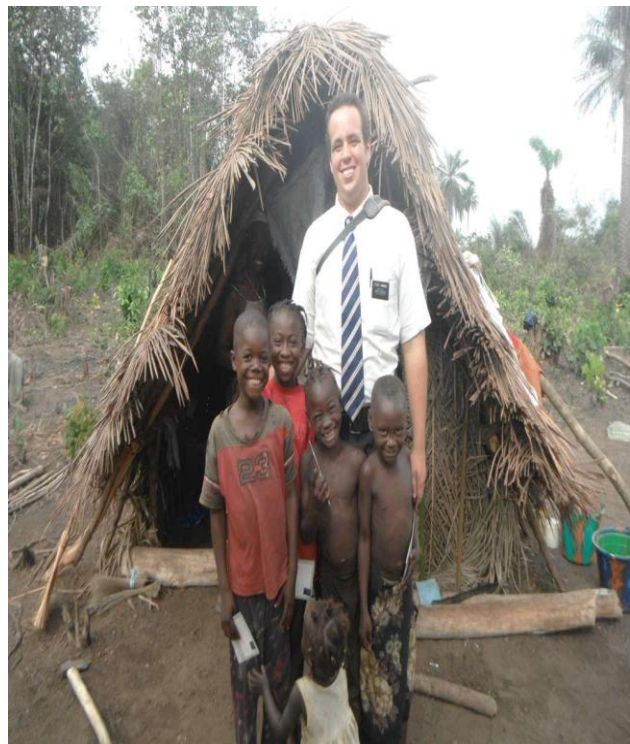
Interaction with youth and community members in Liberia