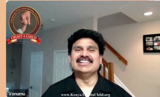
Interaction with Kenyan Children