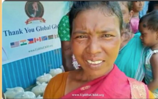
Earthquake Relief | Assam, India