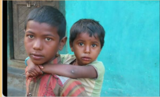
House Visiting | India