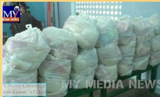
Leprosy Families Help