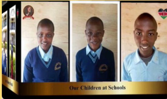
Glimpses of 2021