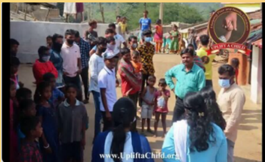
Karaput, Odissa | India