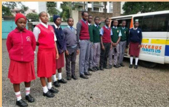
Uplift a Child Kenya