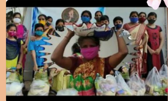
COVID Critical Help