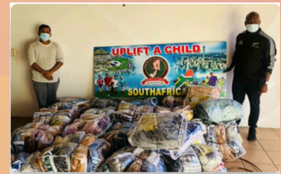
Uplift a Child South Africa