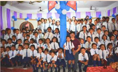
2025 Shree Schoolchoun, Jhapa, Nepal Annual Program Read More

We were able to meet with children from more than 15 different schools during our Annual Program events and other gatherings held across Nepal, Kalimpong, Assam, West Bengal, Tuni, Hyderabad, Nuzvid, Narsapur, and Visakhapatnam. These visits allowed us to connect directly with students, understand their needs, and strengthen partnerships with schools and communities.