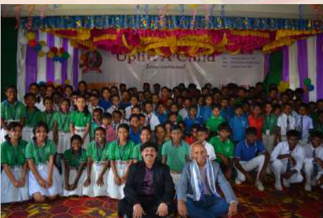
2025 Assam & Other West Bengal Schools Annual Program Read More