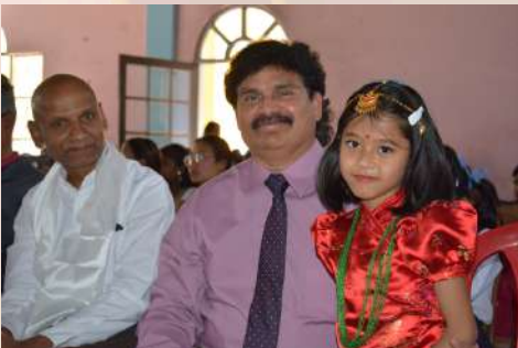
2025 Kalimpong, West Bengal Annual Program Read More