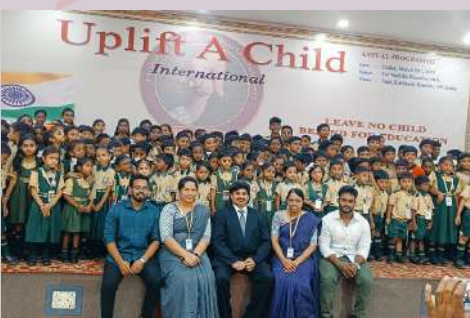
2025 Tuni, Andhra Pradesh Annual Program Read More