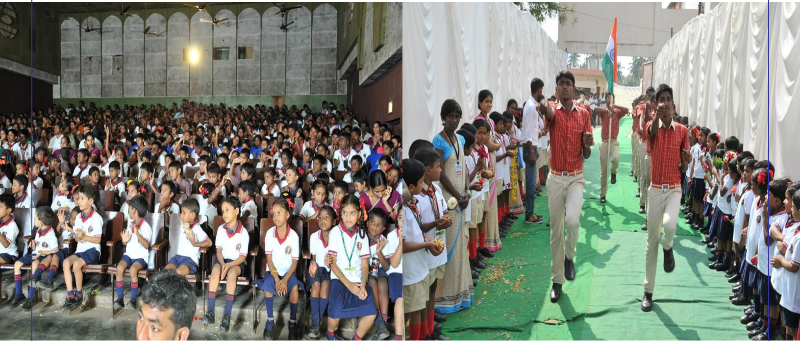
2015AP-Vizag Uplift a Child Annual Program (January 4 th at 10:30am)