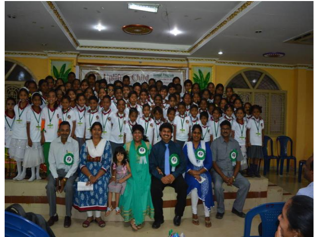
2015AP-Anakapalle Uplift a Child Annual Program (December 28 th at 10:30am)