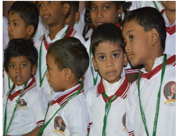
2015AP-Chittoor Uplift a Child Annual Program (December 14 th at 10:30am)