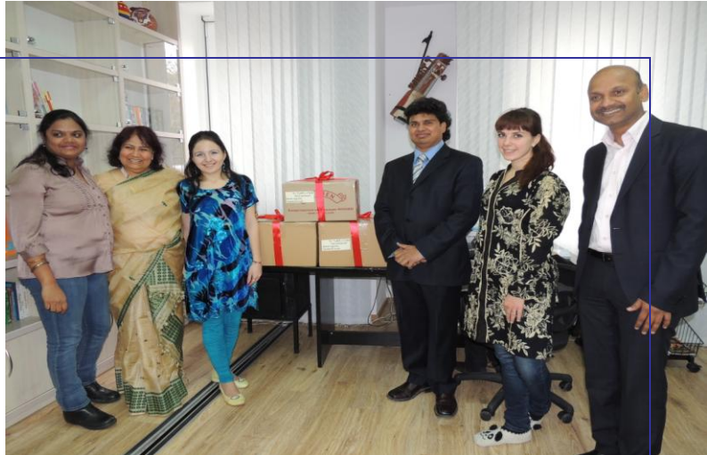
Sanskriti presented gifts to send to our children in India