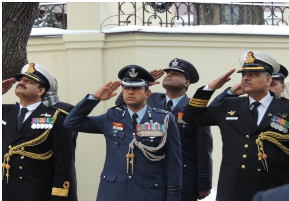
Indian Embassy – Kiev, Ukraine