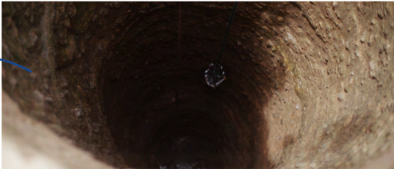
Image of the well that have claimed innocent children's life