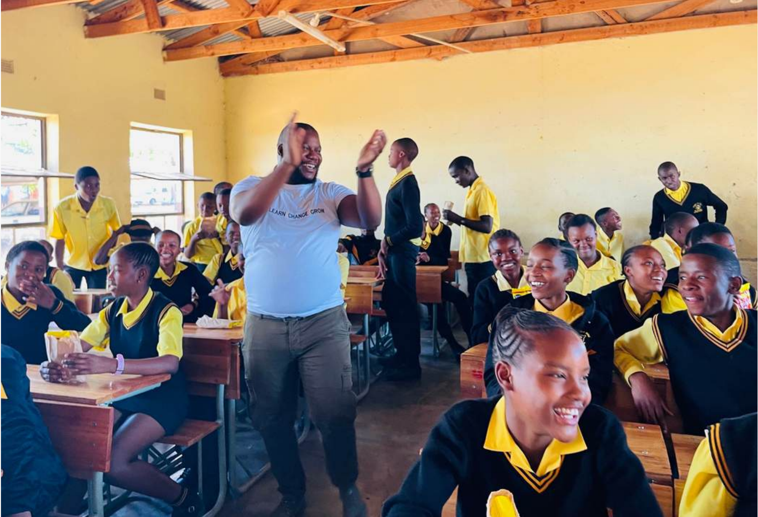
Christ Church Preparatory School & College 20 February 2025 | Midrand