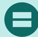
SDG #10 Reduce Inequality