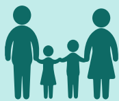
SDG #1 End Poverty