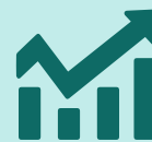
SDG #8 Promote sustained, inclusive and sustainable economic growth, full and productive employment and decent work for all