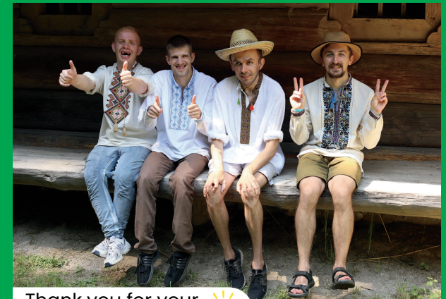
Thank you for your open heart

Your donation can significantly transform their lives and destinies.