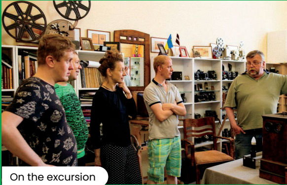
On the excursion