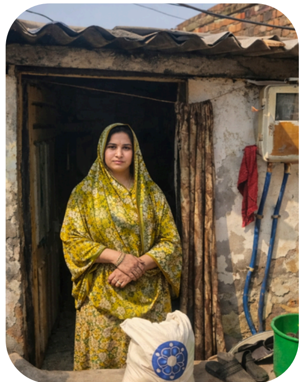
Representative image created using AI to safeguard identity.