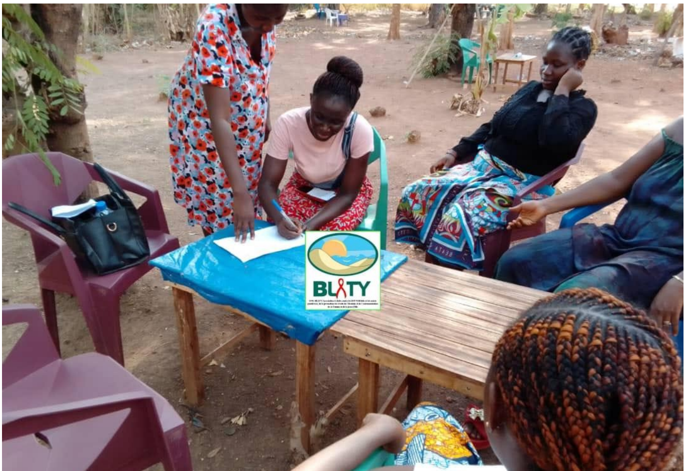
BLETY: Group Awareness Session