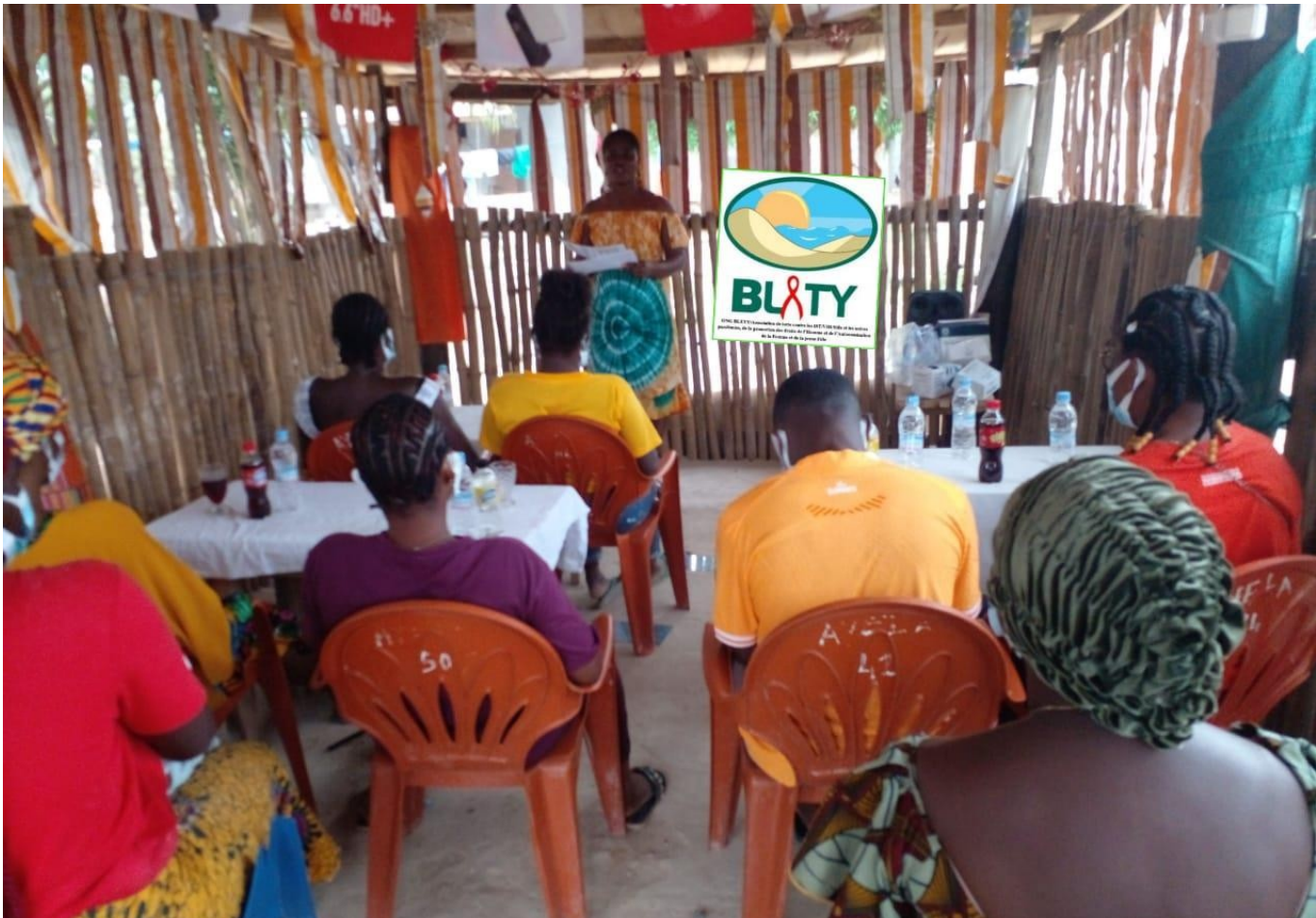
BLETY: DABOU group support session