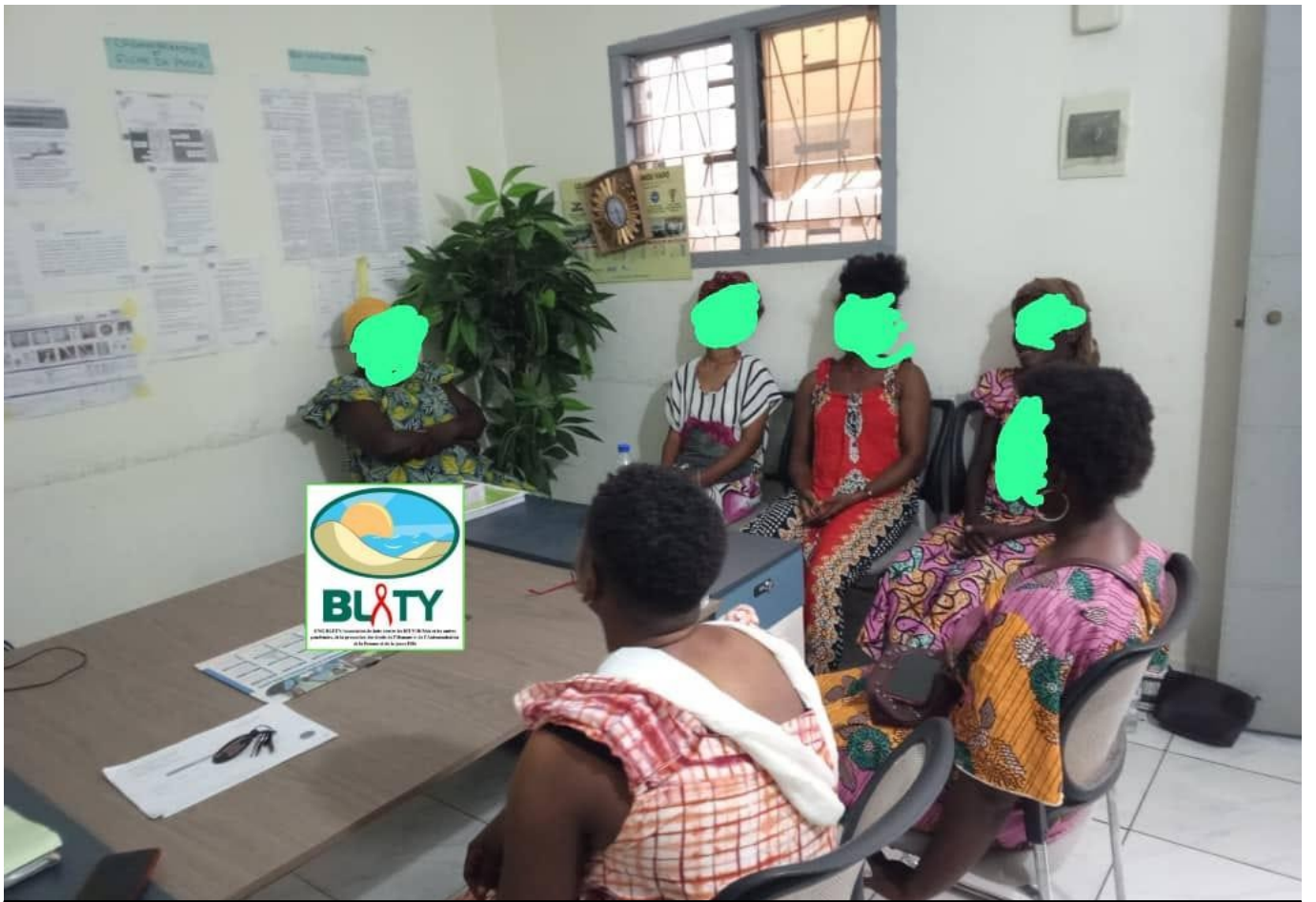
BLETY: SIKENSI group support session