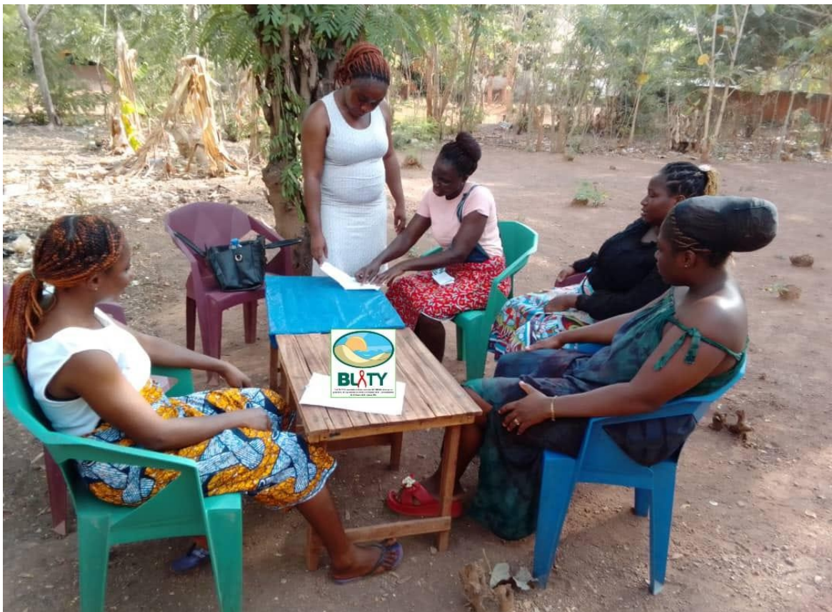
BLETY: Awareness-raising session for JFVES in the DABOU district