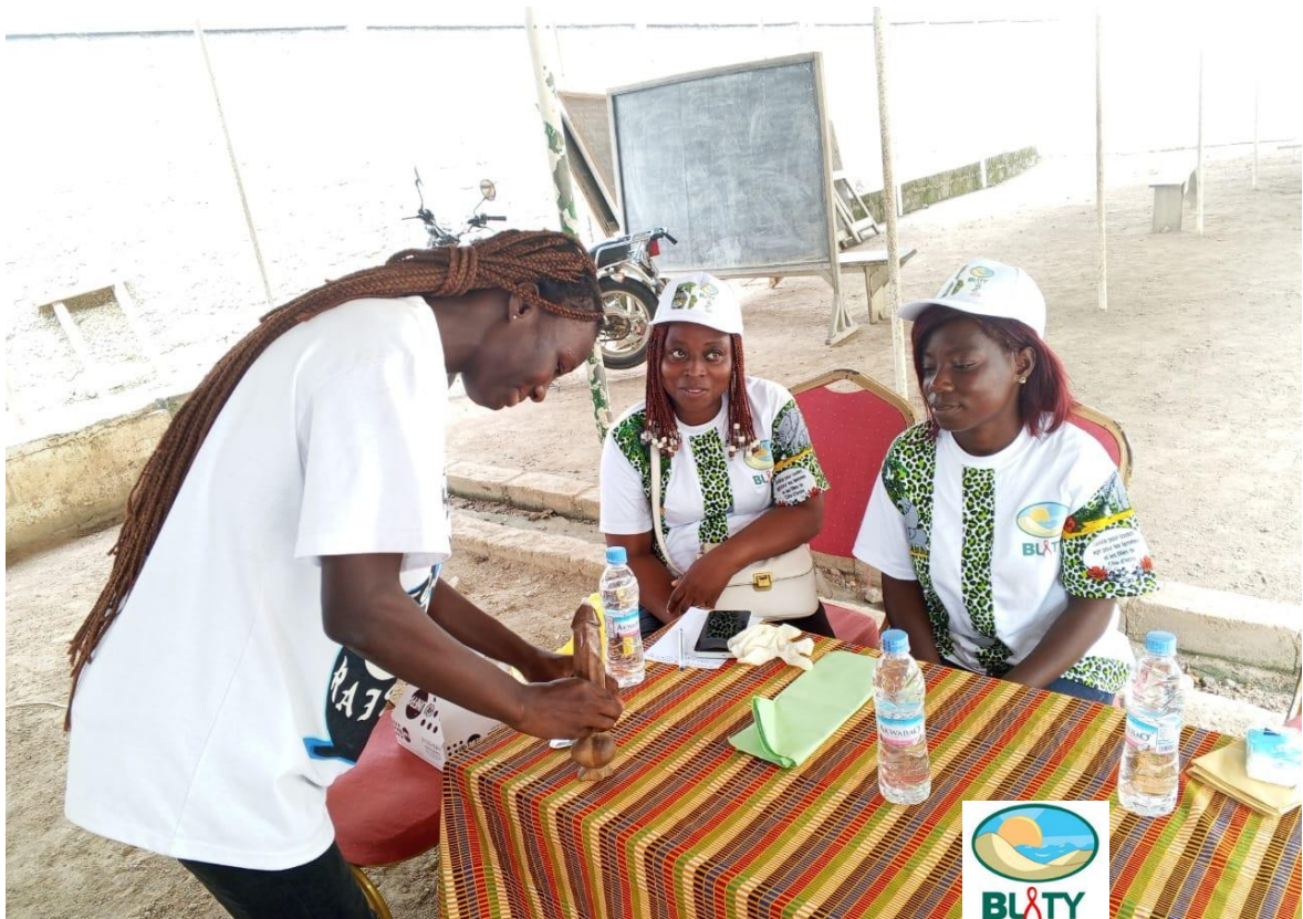
BLETY: Awareness-raising session for JFVES in the SIKENSI district