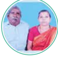
House No. 16 A U Devasia Perumpadav Kannur, Kerala.