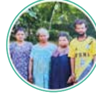
House No. 12 C Bindu Alathur Palakkad, Kerala.