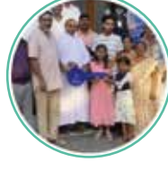
House No. 20 Rosakutty Varapetty Muvattupuzha, Kerala.