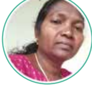
House No. 28 Mini Vazhu Vatta Wayanad, Kerala.