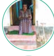
House No. 26 Rajamani Vaduvanchal Malankolli, Kerala.