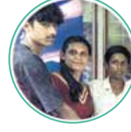
House No. 18 Sanchu T V Padichira Wayanad, Kerala.