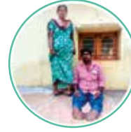
House No. 6 Kamalamma T Narasipura Village, Bangalore.