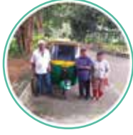
House No. 7 Srinivas Narasipura Village, Bangalore.