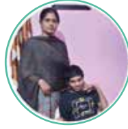
House No. 5 Sheela Dasanapura Hobli, Bangalore.