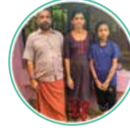
House No. 9 Shreevalsa Nileshwar, Kasaragod, Kerala.