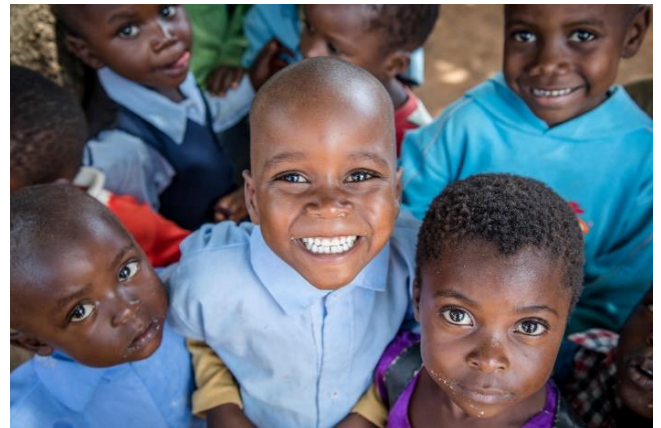
Vulnerable children in Malawi's Zomba District attend a preschool supported by Save the Children, where they gain the nutritional and educational support they need to learn and thrive.

Despite significant progress for children, millions are excluded because of who they are or where they live. Girls are among the most marginalized, and we strive to ensure they have the same opportunities as boys to maximize their potential.