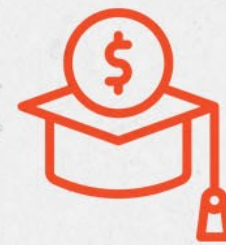
FUTURE INNOVATORS Stem Program