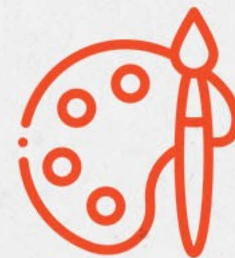
CREATIVE CHAMPS Arts Program