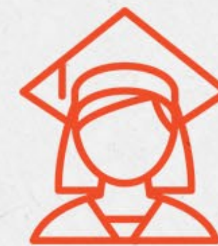
RISE UP Empowerment program