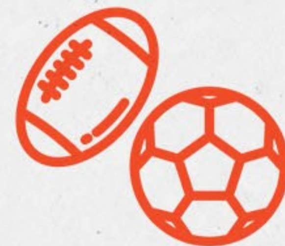
ALL-STAR Sports Program