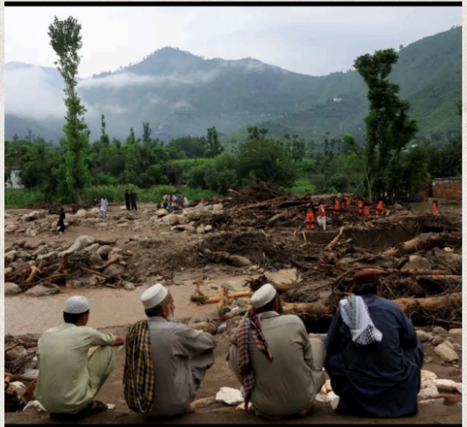
Image: Rescue workers search rubble of houses in Bayshonai Kalay, Buner, after storm-driven rains and floods on August 17, 2025

In Buner, rare cloudbursts and landslides killed over 200 people in two days, wiping out entire villages.