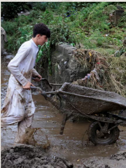
Image: Residents clear a street after floods in Bayshonai Kalay, Buner district, Khyber Pakhtunkhwa, Pakistan, August 17, 2025.