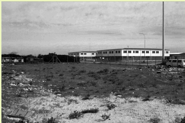
Before: "New Sakhe" community garden - A sad, sandy, dusty area in the middle of Kayelitsha...

Co-ordinating Office Physical Address: c/o The Business Place Philippi, 7 Cwango Crescent (Cnr New Fisleben Rd and Landsdowne Rd, behind Shoprite Centre) Philippi, 7785, Cape Town tel: 021 3711653 – fax: 086 6131178 Postal Address: PO Box 44, Observatory, 7935 Khayelitsha Garden Centre tel/fax: 021 3613497 Nyanga Garden Centre tel/fax: 021 3863777 email: info@abalimi.org.za web: www.abalimi.org.za