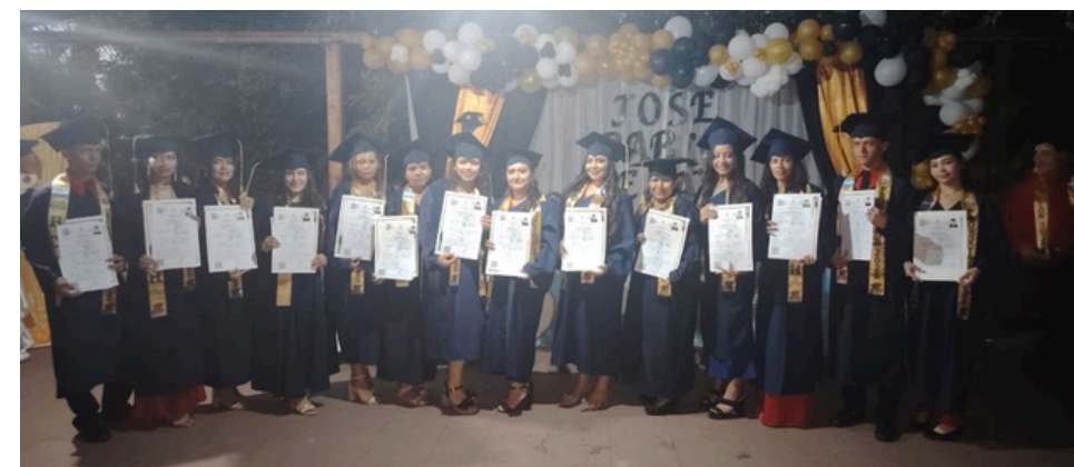
Alternative education beneficiaries by level