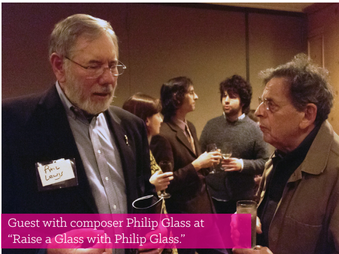
Guest with composer Philip Glass at "Raise a Glass with Philip Glass."

Get to know fellow arts lovers, CMNW's extraordinary artists, and make new friends all while supporting an incredible cause!