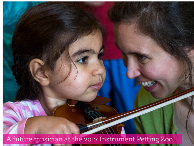
A future musician at the 2017 Instrument Petting Zoo.