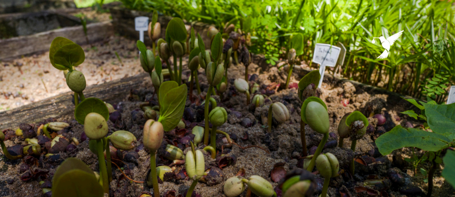
Number of hectares under restoration*